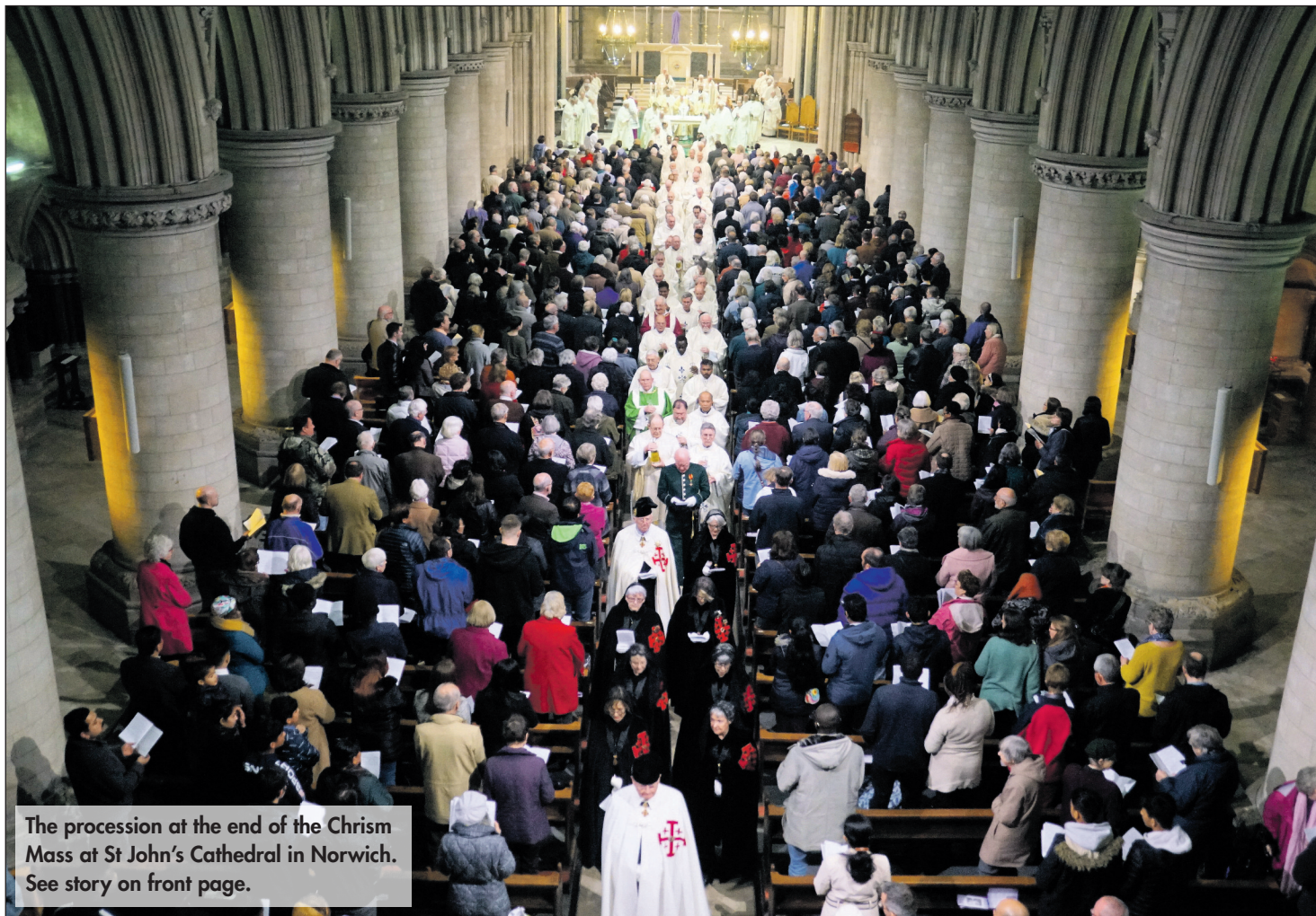
The procession at the end of the Chrism Mass at St John's Cathedral in Norwich. See story on front page.