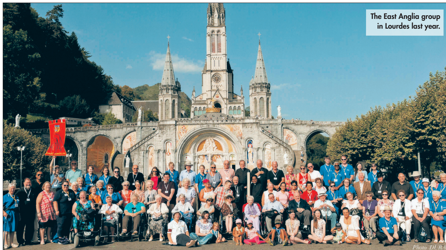
The East Anglia group in Lourdes last year.

■ To travel out as a group from Stansted, met at the airport and taken to our hotels