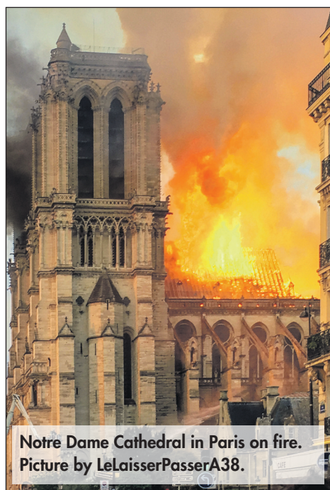
Notre Dame Cathedral in Paris on fire.

He described the cathedral as "the soul of France" and said: "I am just heart-broken and feel so much for the people of Paris and France. I would urge people to