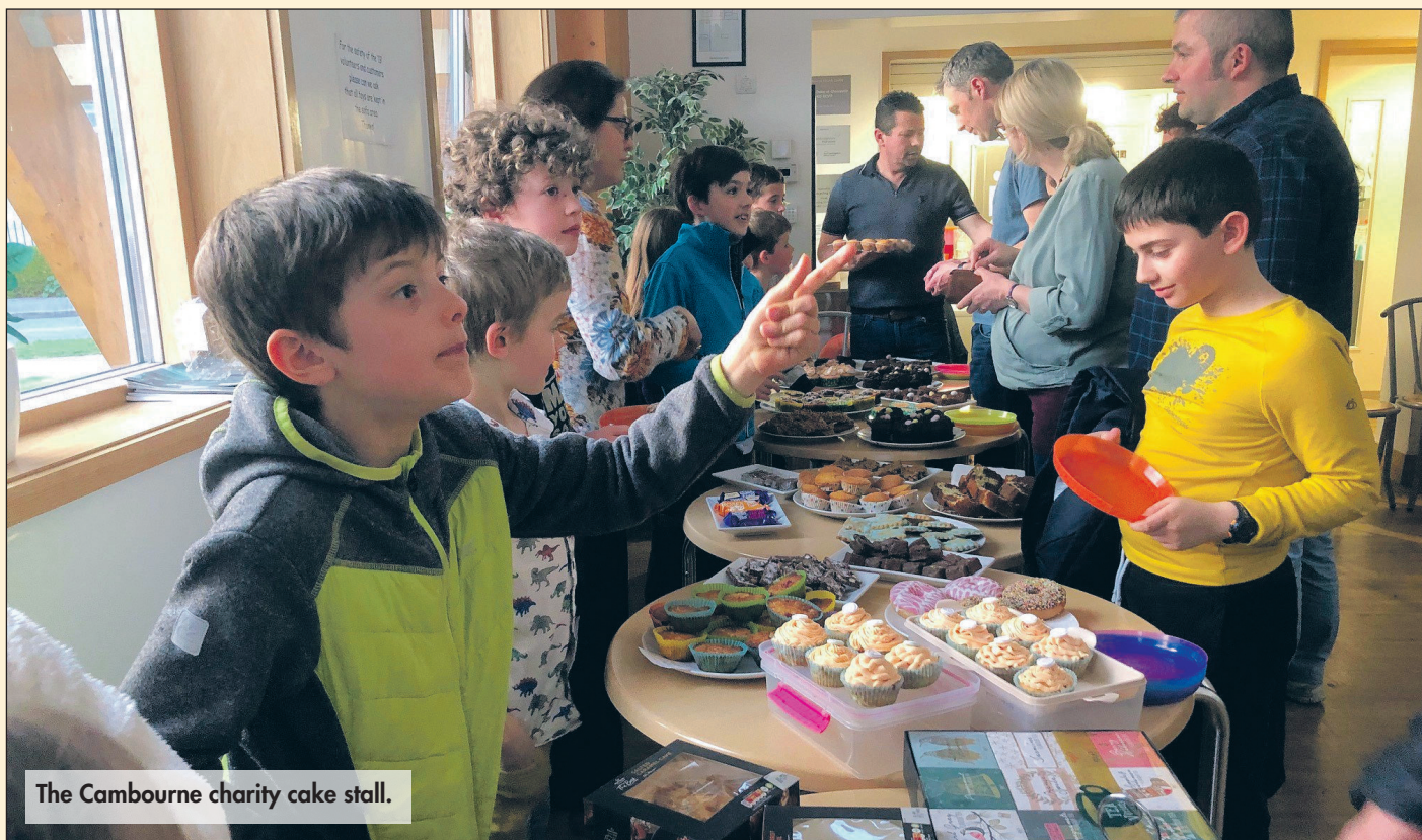
The Cambourne charity cake stall.

The first communion catechists were delighted with Anastasia's input saying: "It was a great example of how catechetics can be lived by the whole community - not isolated with 'books in a back room'."