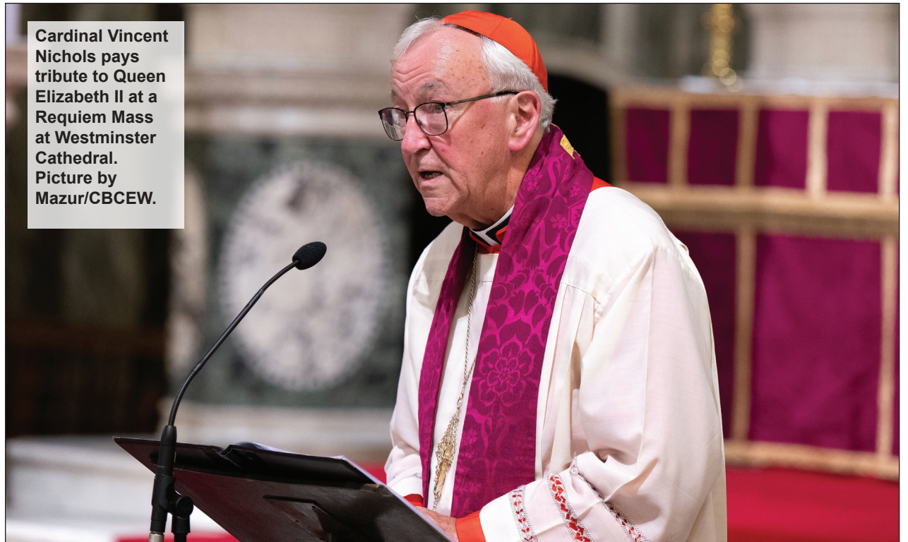
Cardinal Vincent Nichols pays tribute to Queen Elizabeth II at a Requiem Mass at Westminster Cathedral.

Cardinal Vincent Nichols, Archbishop of Westminster has paid the following tribute to HM Queen Elizabeth II: