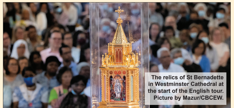
The relics of St Bernadette in Westminster Cathedral at the start of the English tour.

St Bernadette was born in Lourdes in 1844, the eldest of nine children, into a humble family which had fallen into poverty. She was frail and received the last rites three times during her childhood.