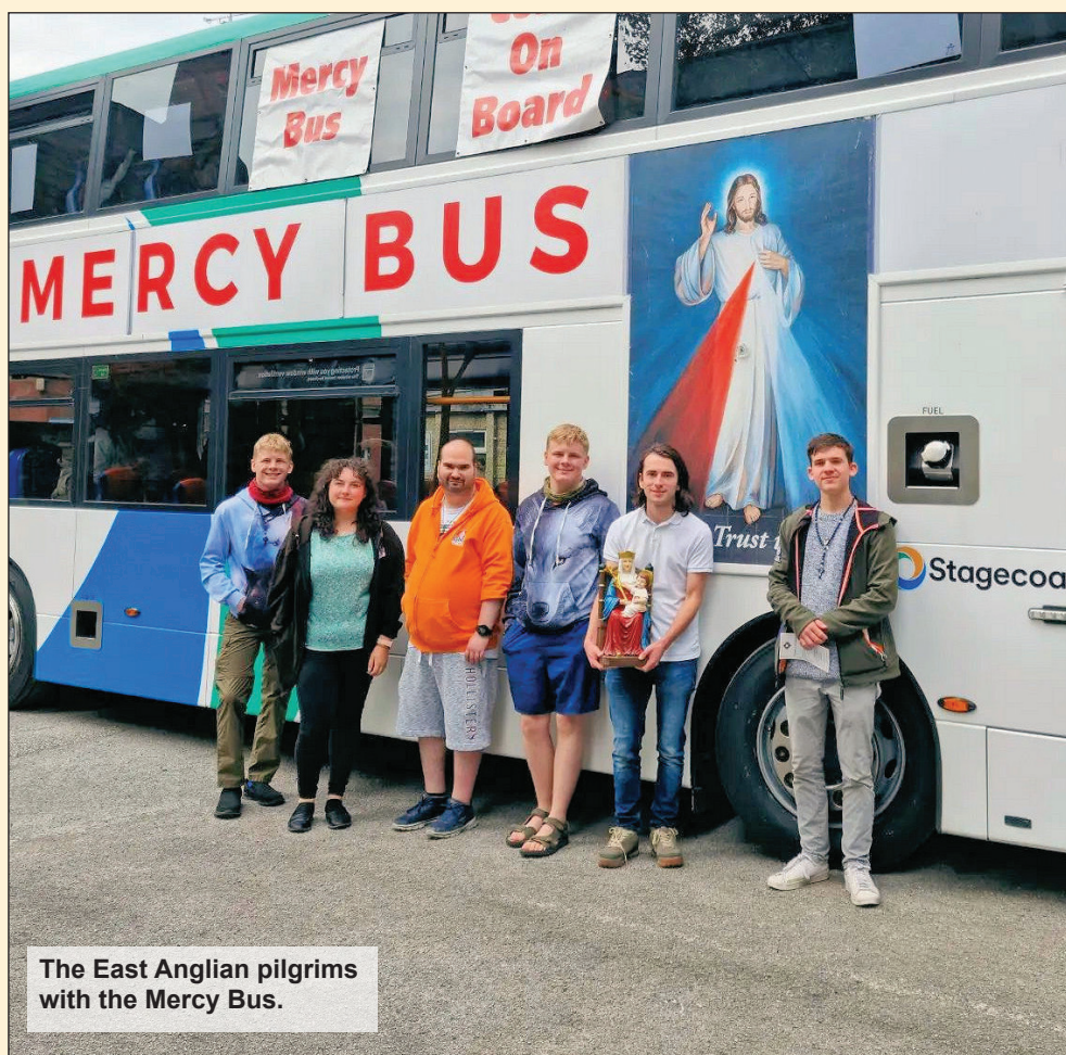
The East Anglian pilgrims with the Mercy Bus.

The opportunity for Confession and daily Mass was greatly appreciated and all agreed that it was great few days in the company of God, of each other and of some remarkable ancient saints.