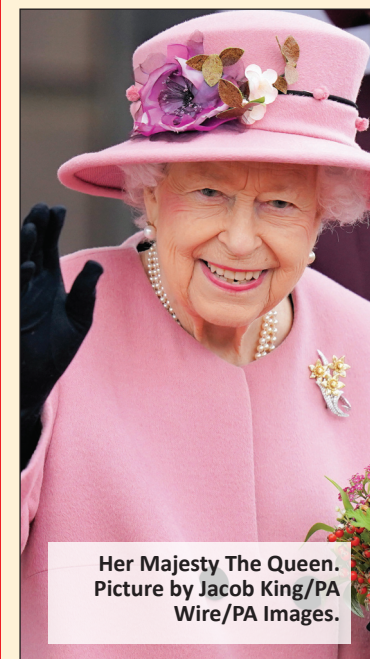
Her Majesty The Queen.

“Commending her noble soul to the merciful goodness of our Heavenly Father, I assure Your Majesty of my prayers that Almighty God will sustain you with his unfailing grace as you now take up your high responsibilities as King. Upon you and all who cherish the memory of your late mother, I invoke an abundance of divine blessings as a pledge of comfort and strength in the Lord.”