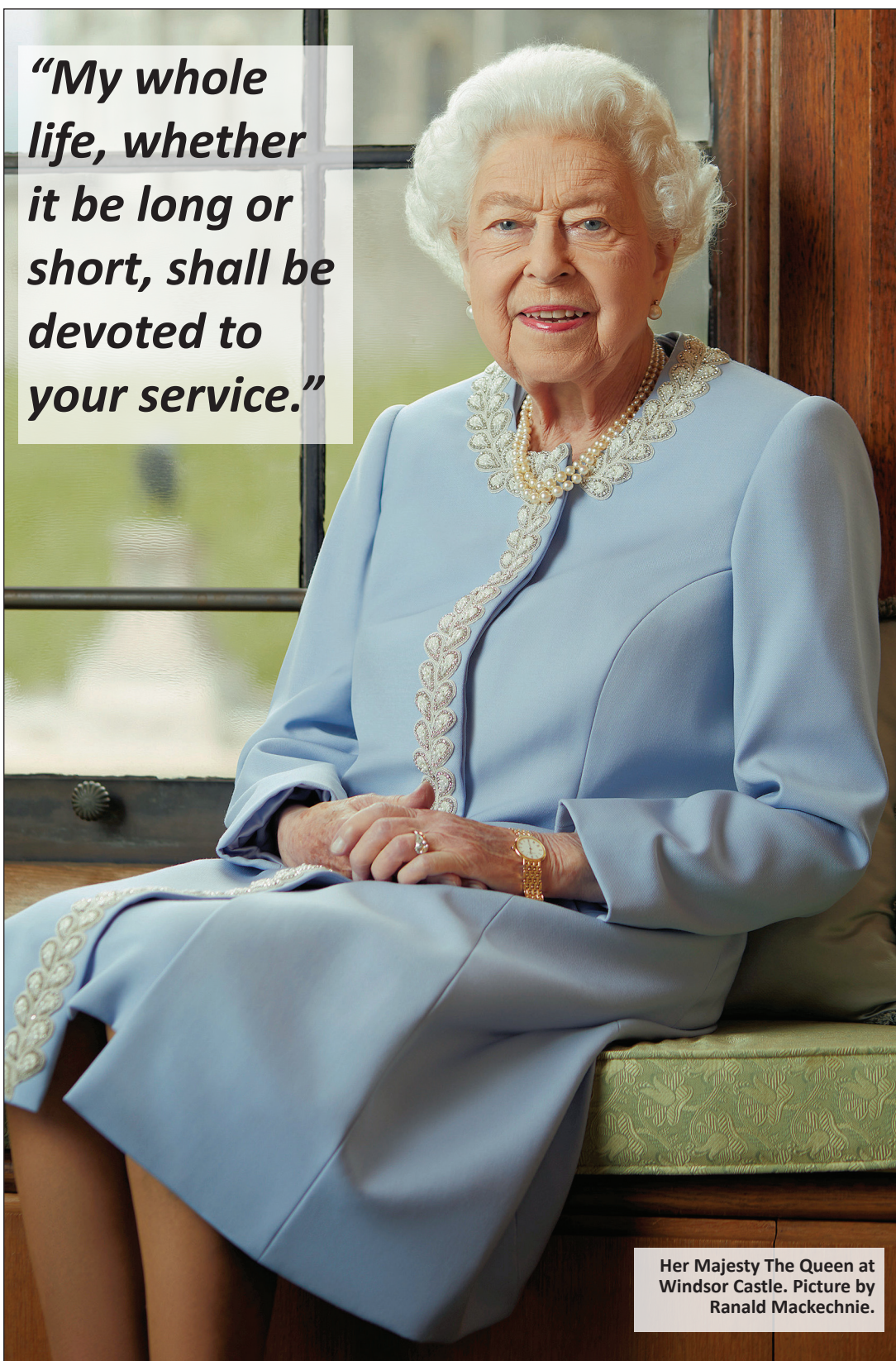
Her Majesty The Queen at Windsor Castle.

“My whole life, whether it be long or short, shall be devoted to your service.”