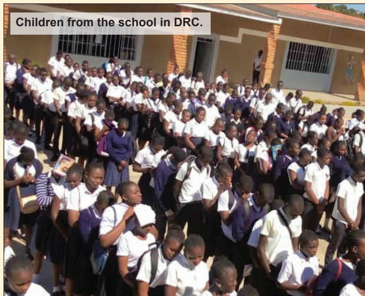
Children from the school in DRC.