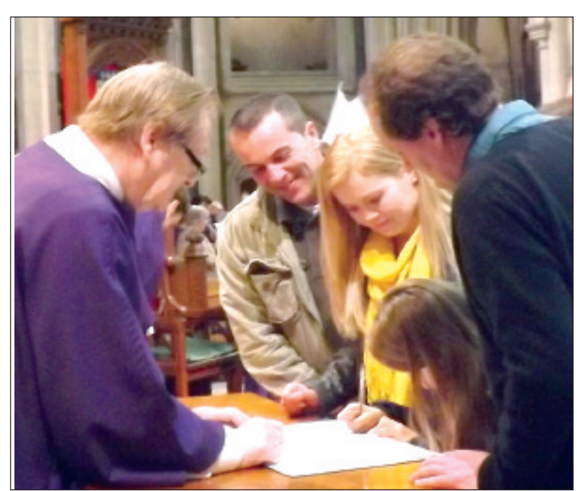
Catechumens of all ages wrote their names in the Book of Life

People from parishes all over the Diocese of East Anglia came to the Cathedral on the first Sunday in Lent came for the Rite of Election as they began the last stage of their initiation into the full communion of the Catholic Church.