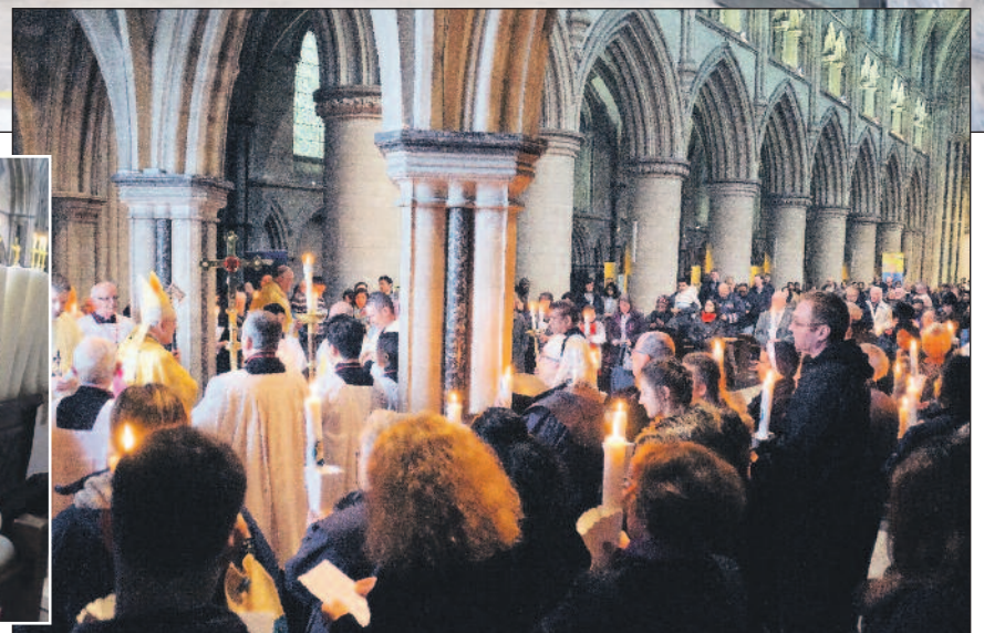
Pictures from the Closing of the Door of Mercy at St John's Cathedral in Norwich on November 20.