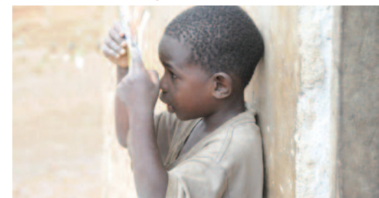
He can hardly see objects more than 50cm away.