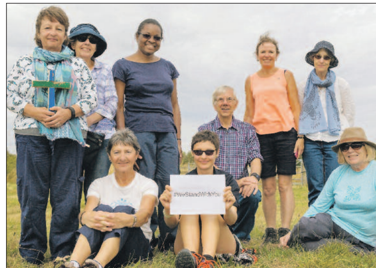
Diss parishioners carried a Lampedusa cross on their pilgrimage.

Next day, a session entitled Tread Lightly on the Earth invited parishioners to share what they were doing in their daily lives to reduce their carbon footprint, and what their next steps might be. Their pledges for action, written on green hearts, included flushing the loo less, using a renewable energy provider, eating less meat and writing to their MPs to call for action on climate change.