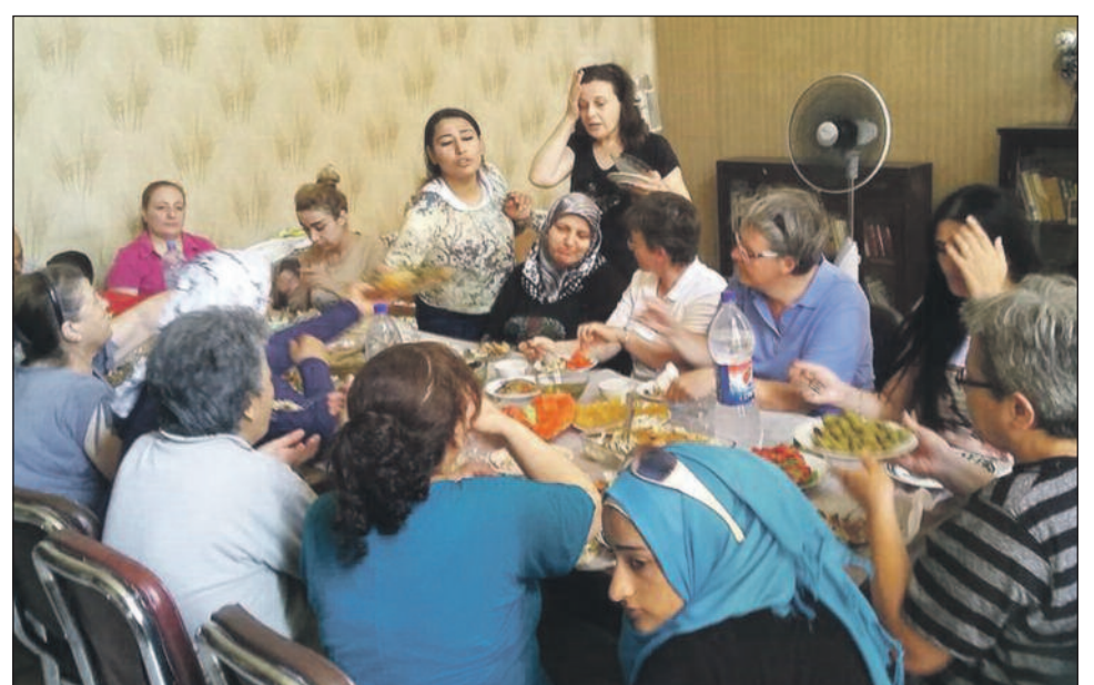
A meal being served by the Franciscan Missionaries of Mary in Aleppo.

"We experience all atrocities of war from one side but a lot of beautiful