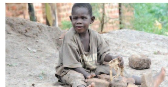
Blessing's cataracts mean he has been living in darkness.