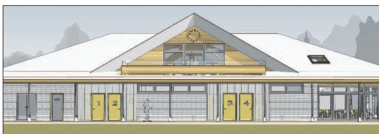
An artist's impression of the new pavilion.

Owned by St Mary's, and leased to Homerton College, the site will feature two new Astro-Turf pitches - for hockey, and for rugby and football; new netball and tennis courts; athletics facilities comprising a grass running track and field events facilities; practice nets for all ball sports; a new pavilion, including physio room, kitchen, and changing facilities; and floodlighting.