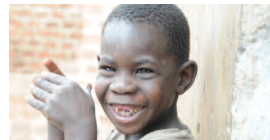
Your gift could open a child's eyes and transform a life.

Christian Blind Mission is a huge inspiration to me. It works in more than 60 countries, including some of the world's poorest communities, to restore sight, mobility and independence to people living with disability. It's putting Christ's love into action for the most marginalised people. Will you join Christian Blind Mission by supporting this amazing work?