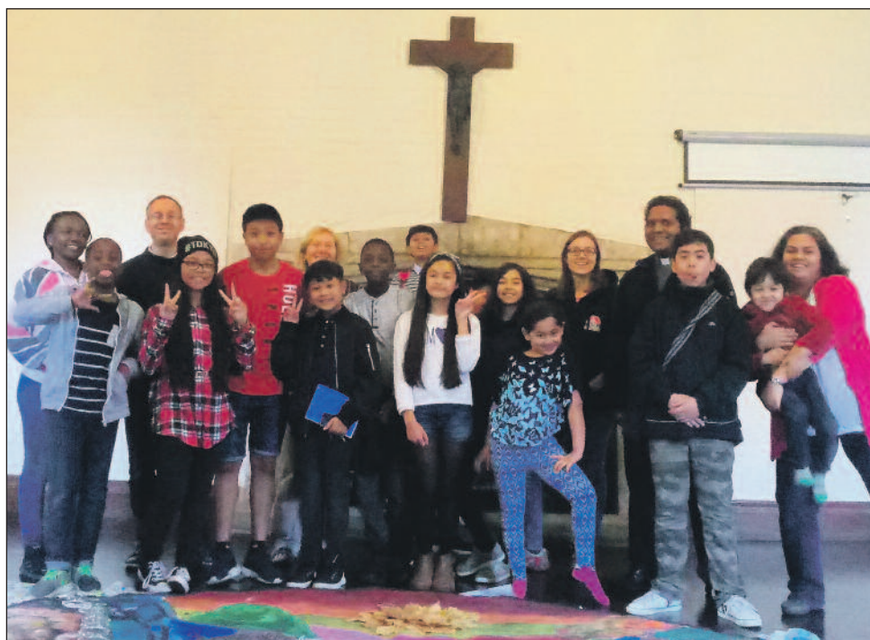
The St John's youth group at Buckden Towers.