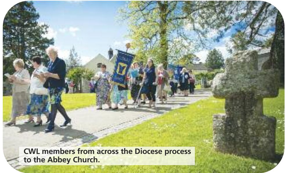
CWL members from across the Diocese process to the Abbey Church.