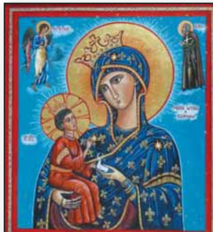
The icon of Our Lady of the Park