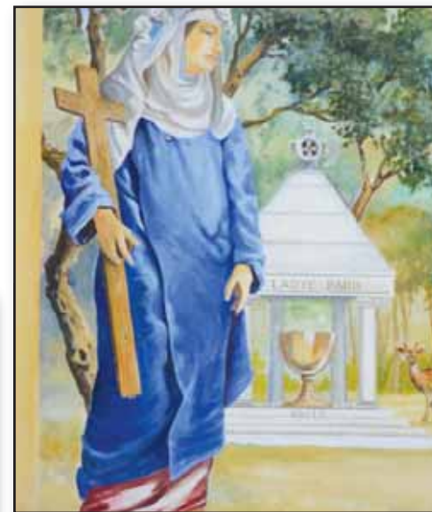
The image of Our Blessed Lady on Liskeard town's mural