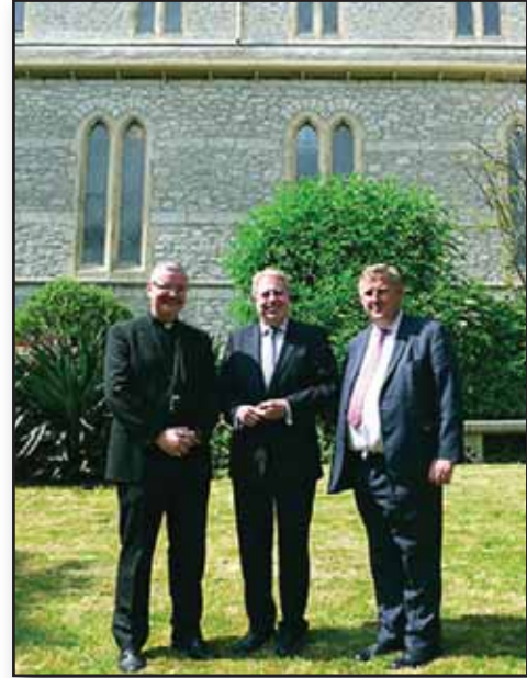
Visit of Rt Hon David Evenett MP, Minister for Sport, Tourism and Heritage, pictured with (L) Bishop Mark O'Toole and (R) local MP, Oliver Colville when inspecting the repair works at Plymouth Cathedral on 9th June.