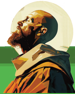
St. Francis de Sales: The Apostle of Love 24th January page 6