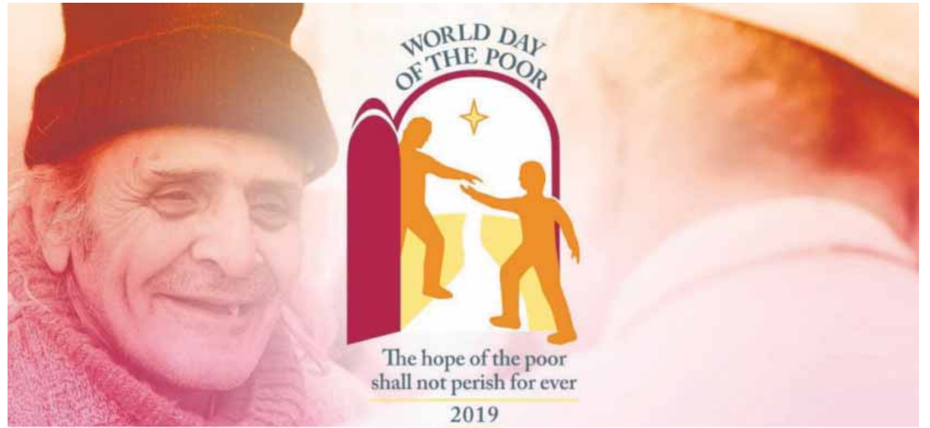
Pope Francis has revealed the World Day of the Poor theme

The theme for this year’s World Day of the Poor, on Sunday November 17, has been revealed as: “The hope of the poor shall not perish forever” (Ps 9:19)