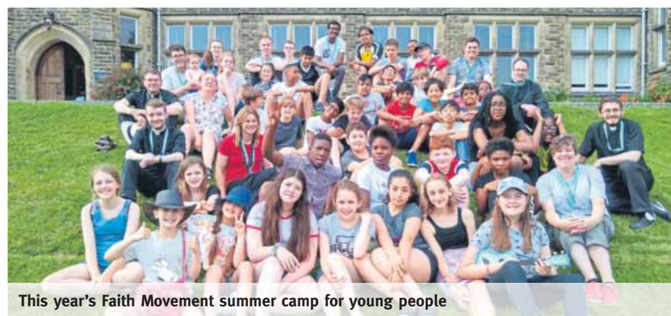
This year's Faith Movement summer camp for young people