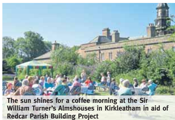
The sun shines for a coffee morning at the Sir William Turner's Almshouses in Kirkleatham in aid of Redcar Parish Building Project