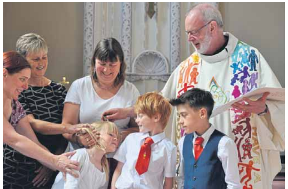
The parish of Our Lady's in Acomb, York, enjoyed a wonderful celebration as three children were baptised, 33 made their First Holy Communion and three young adults were confirmed. Another adult, whose children were being baptised, was received into full communion with the Catholic Church