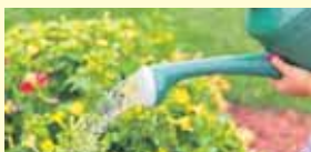
Water the garden in the early morning or at the end of the day

The Friends of the Earth website is a useful source of further information for water-saving ideas. Visit friendsoftheearth.uk .