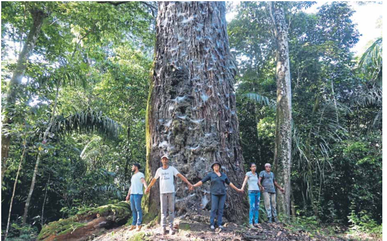
Members of CAFOD partner organisation CPT (Pastoral Land Commission) in the Amazon rainforest, Brazil

See: We must all be aware of the ecological and cultural crisis of the Amazon basin. The diversity of the people and their biome must be protected or human dignity will be lost and the environment further harmed.