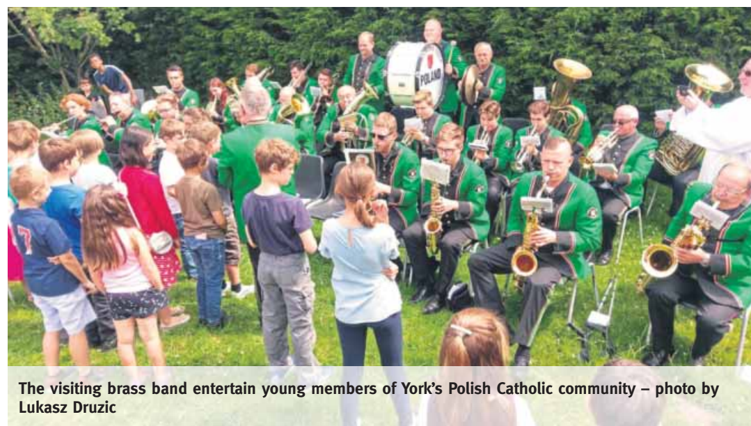
The visiting brass band entertain young members of York's Polish Catholic community