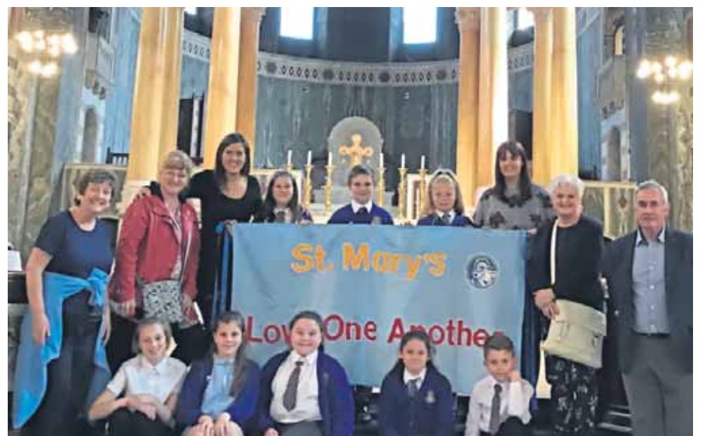
The St Mary's, Grangetown, party at Westminster Cathedral