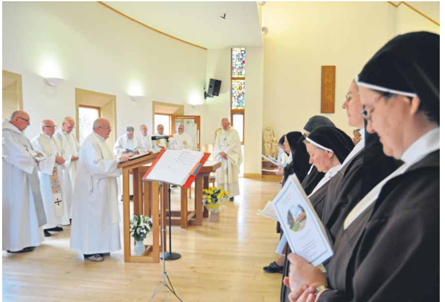
Carmelite nuns at Thicket Priory near York celebrated their tenth anniversary with a Mass of thanksgiving