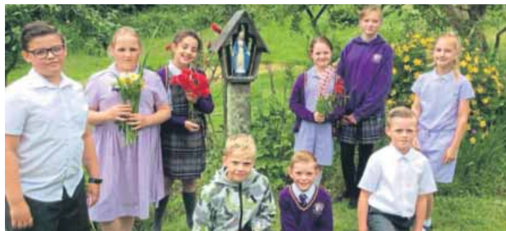
Some of the St Margaret Clitherow children in the garden at Madonna House

Missionaries from St Margaret Clitherow Primary School in South Bank have been learning how we all have a vocation and a call to serve God's children.