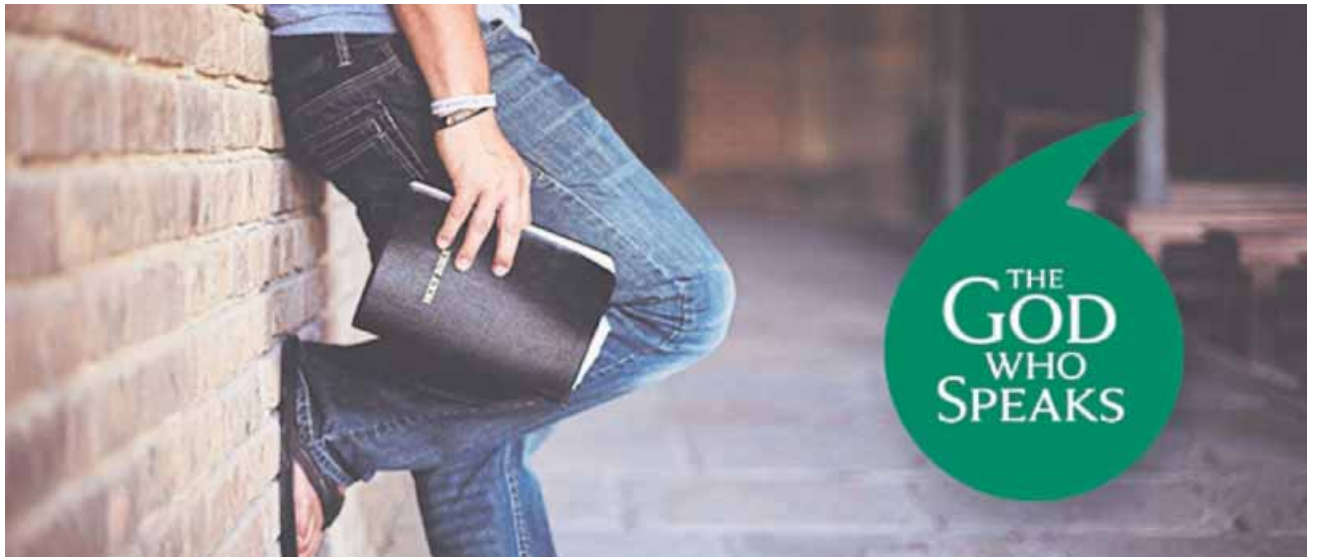
The God Who Speaks initiative aims to explore new ways of responding to God's word.

The survey will ask the same questions when the campaign