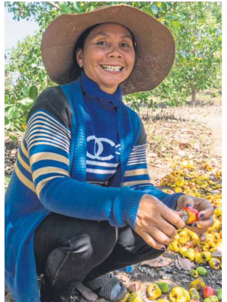
Leum uses natural pest control from the seeds of local trees in Cambodia