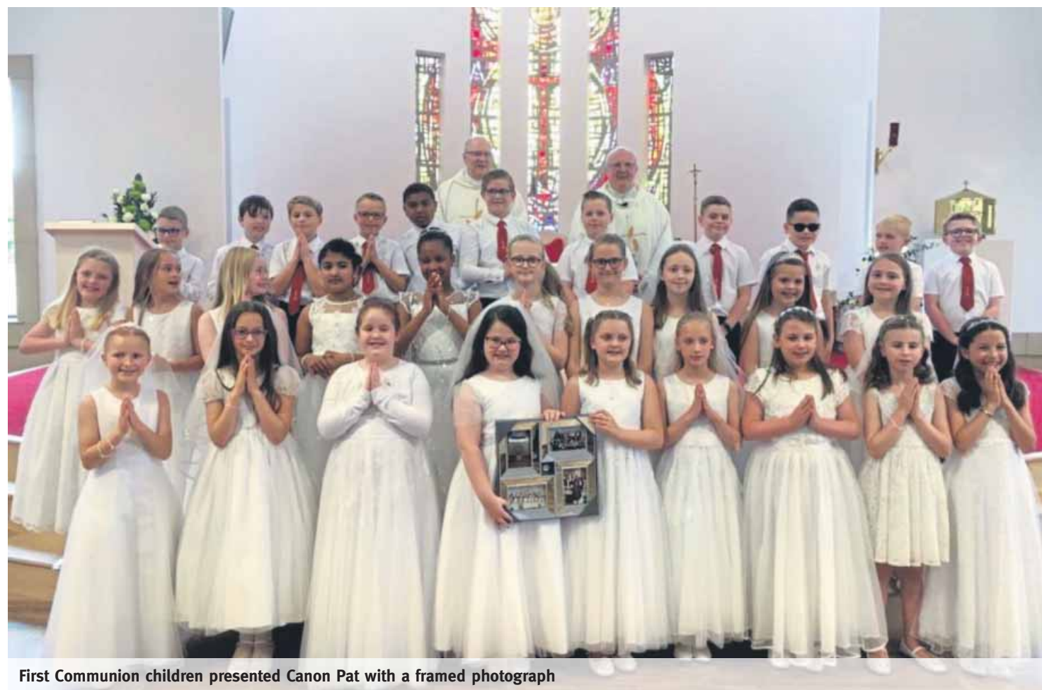
First Communion children presented Canon Pat with a framed photograph