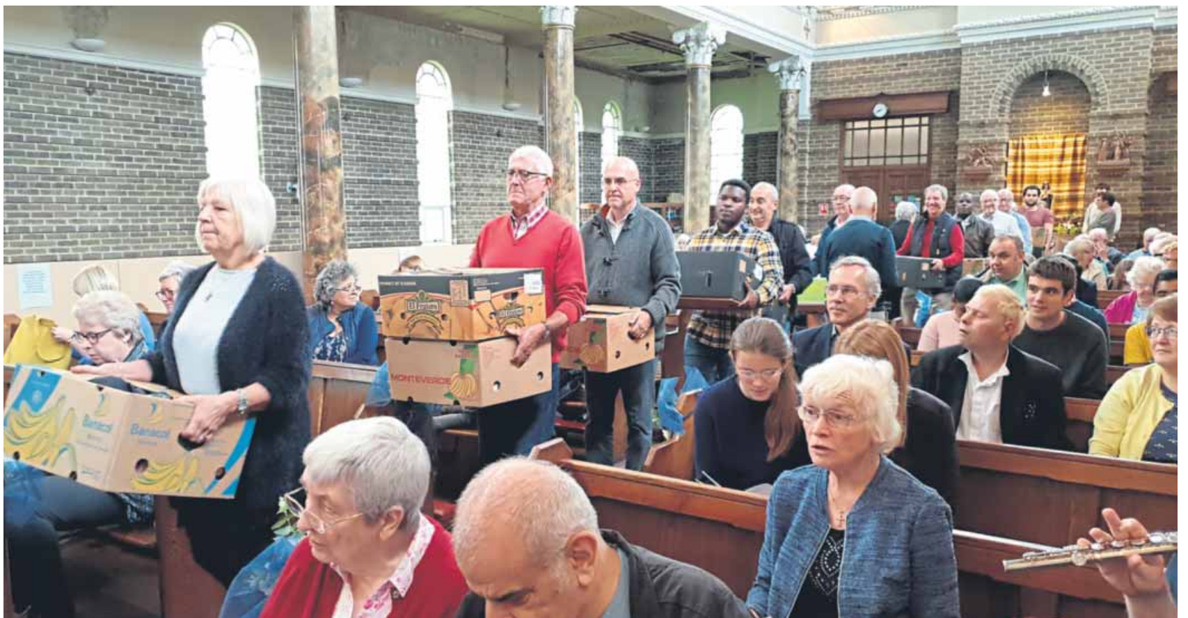
Some of the gifts being brought to the altar