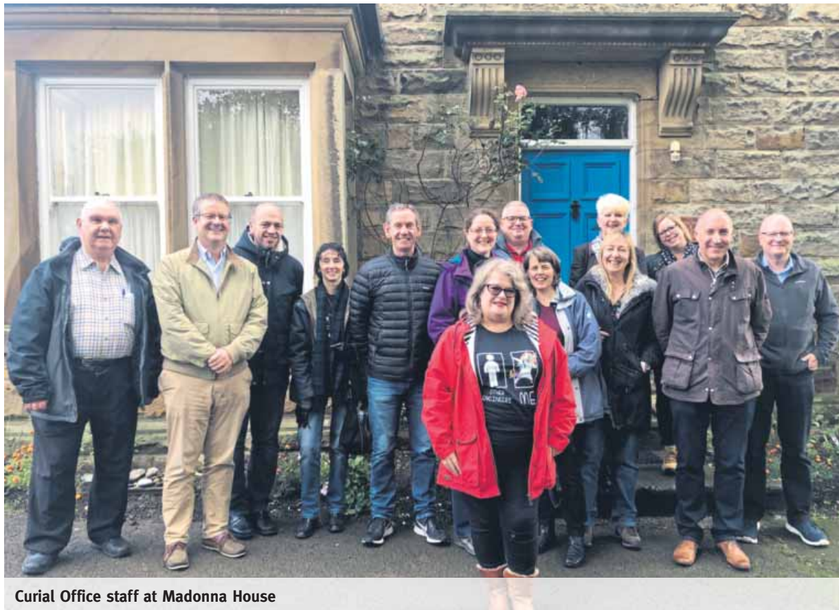
Curial Office staff at Madonna House