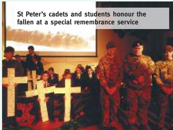
St Peter's cadets and students honour the fallen at a special remembrance service

* St Peter's staff and students raised £150 for CAFOD's Harvest Fast Day with a Bake-Off event and other activities.