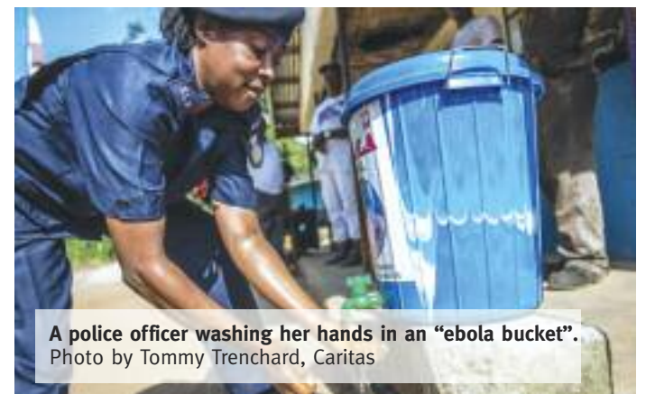
A police officer washing her hands in an "ebola bucket".