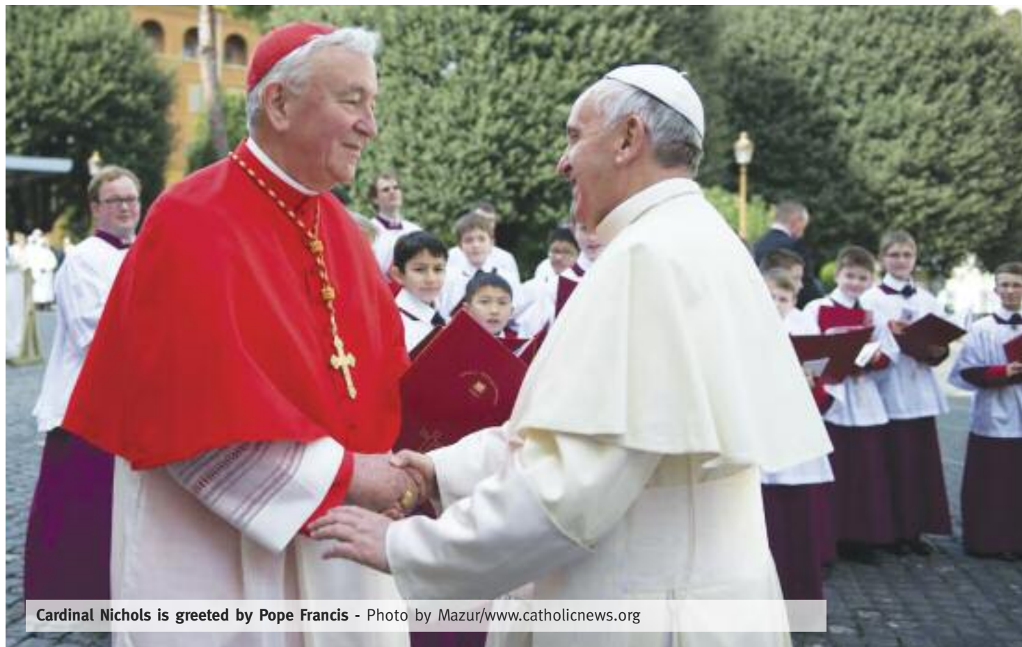
Cardinal Nichols is greeted by Pope Francis