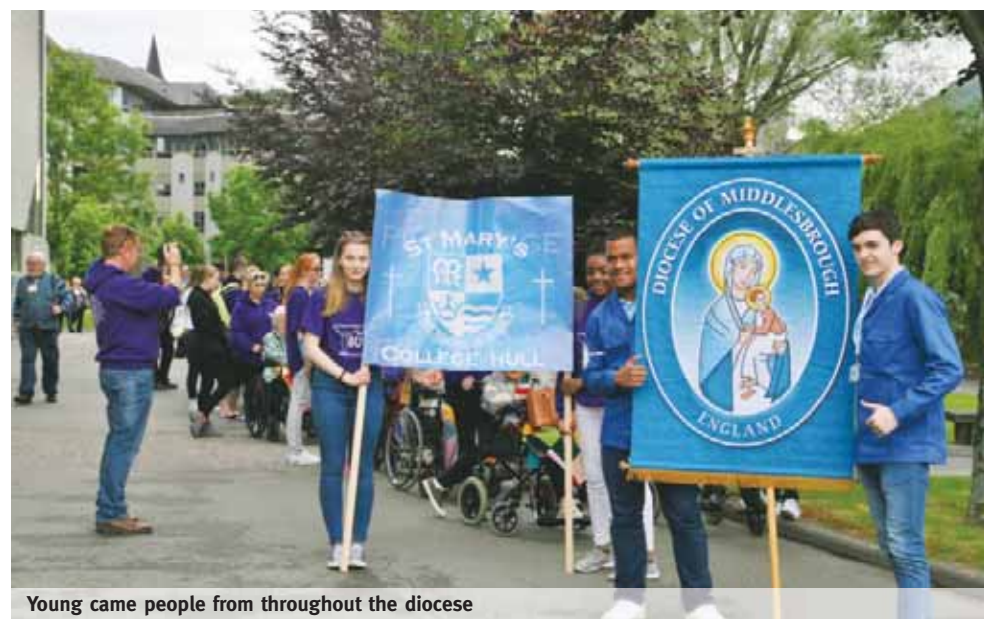
Young came people from throughout the diocese