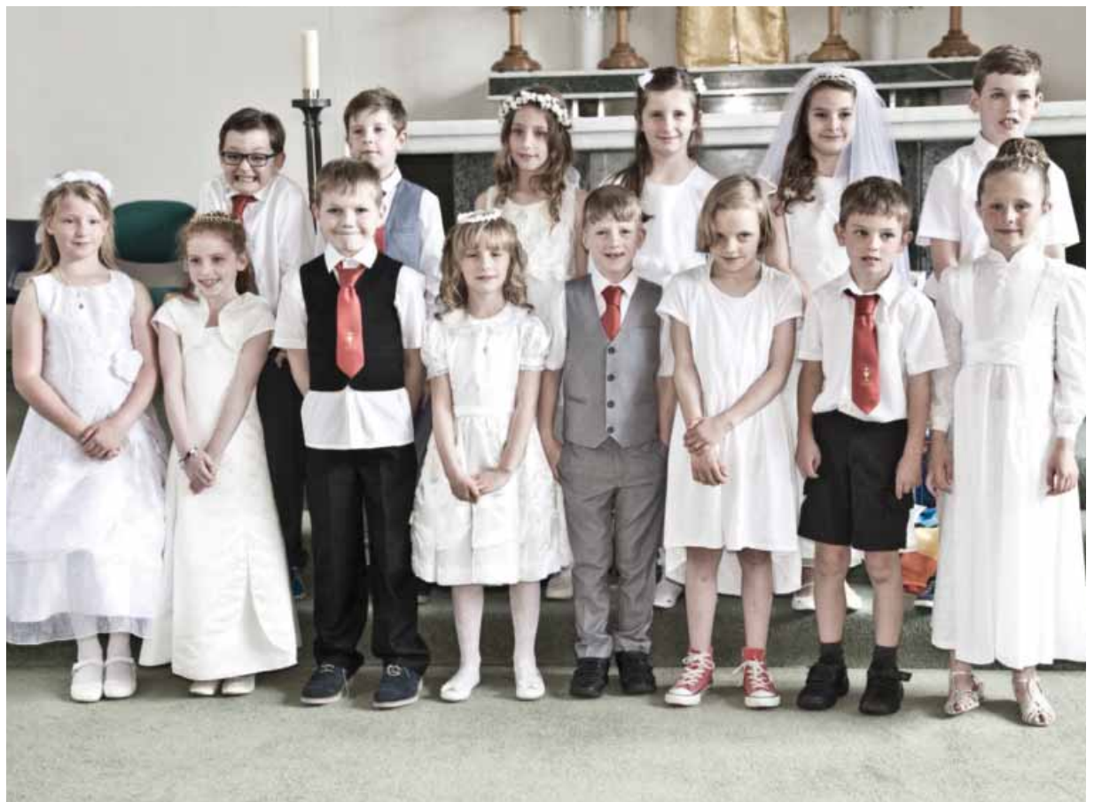
Fourteen children from Our Lady of Perpetual Help Parish, Market Weighton, received their First Holy Communion on the Feast of Corpus Christi.