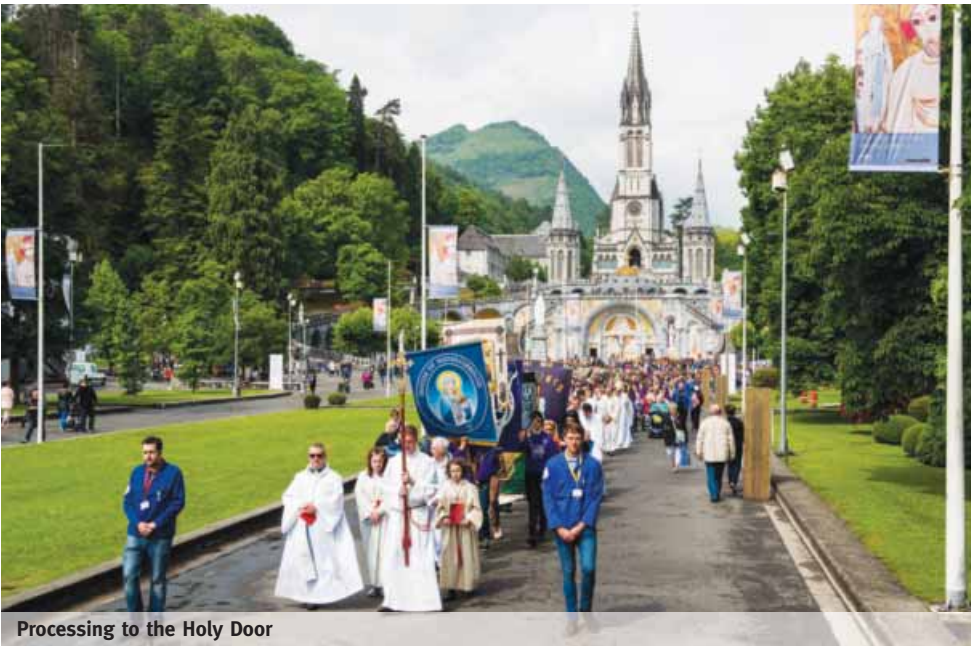
Processing to the Holy Door

All pictures courtesy of Les Clark except the main photo and Holy Door of Mercy photos, which are used by kind permission of Lacaze.