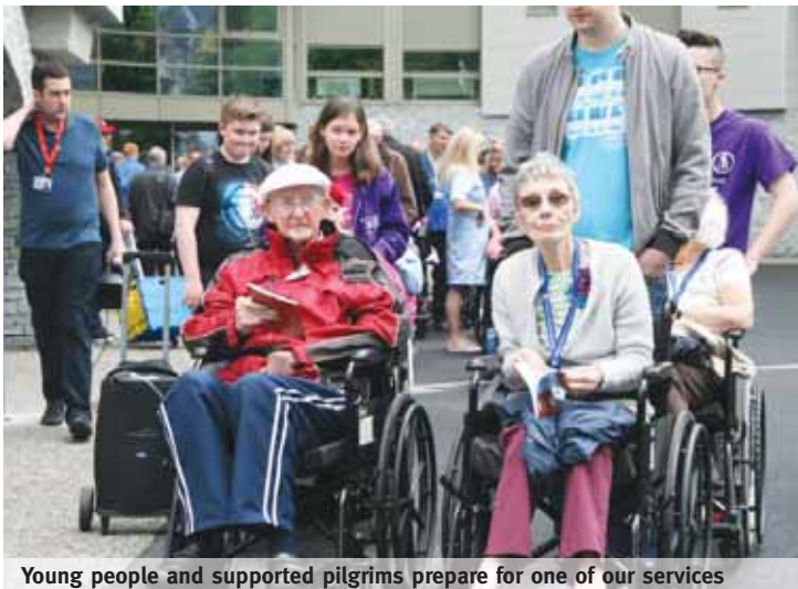
Young people and supported pilgrims prepare for one of our services