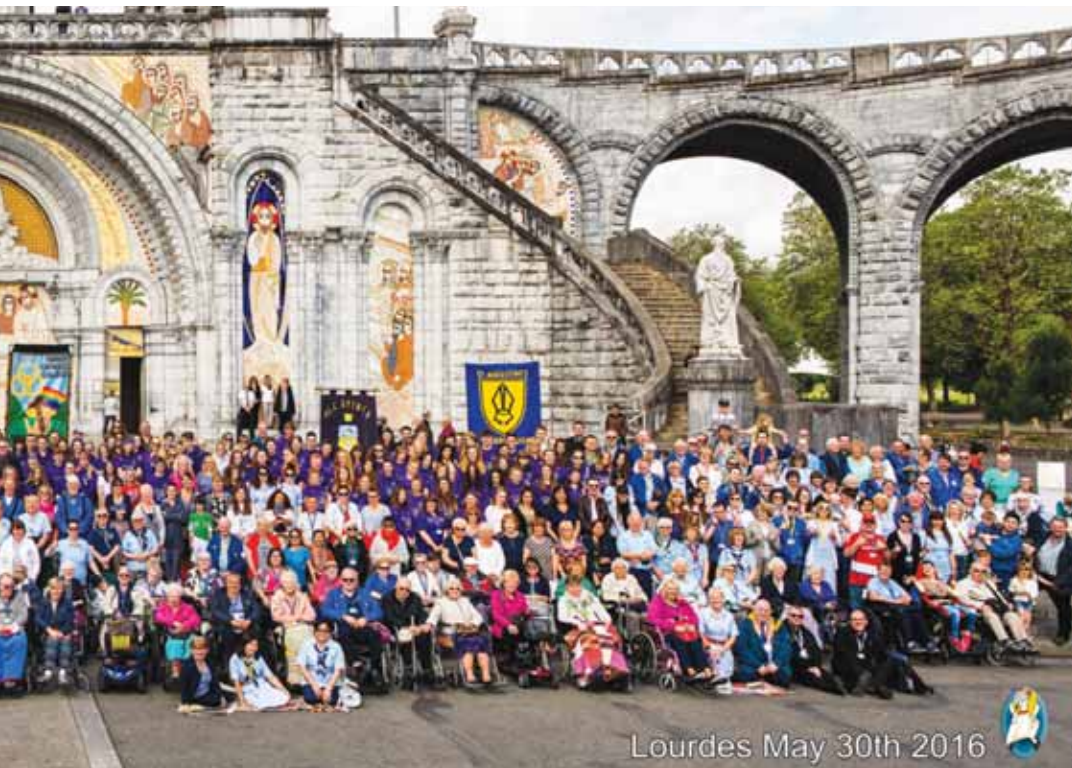
Lourdes May 30th 2016