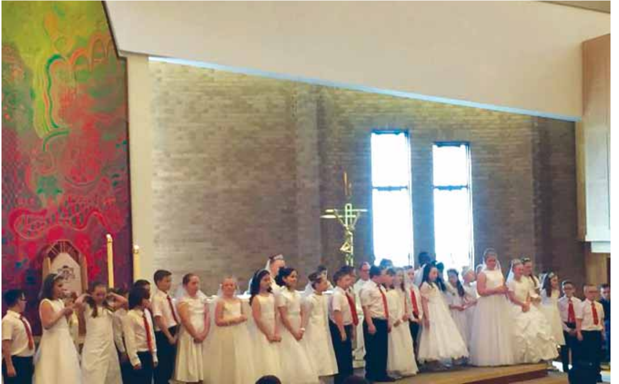
Children who made their First Holy Communion at St Mary's Cathedral in Middlesbrough recently.