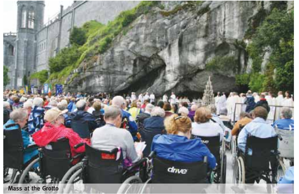
Mass at the Grotto