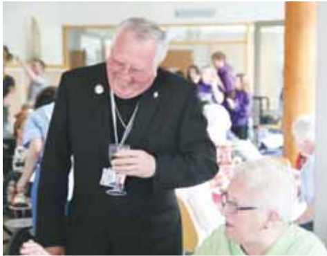
Above and below: Smiles at our tea party