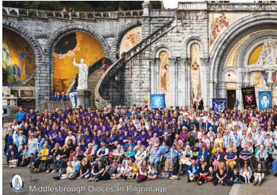
Middlesbrough Diocesan Pilgrimage