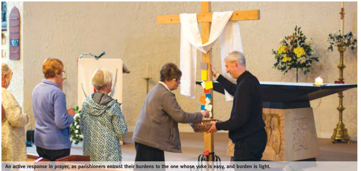
An active response in prayer, as parishioners entrust their burdens to the one whose yoke is easy, and burden is light.