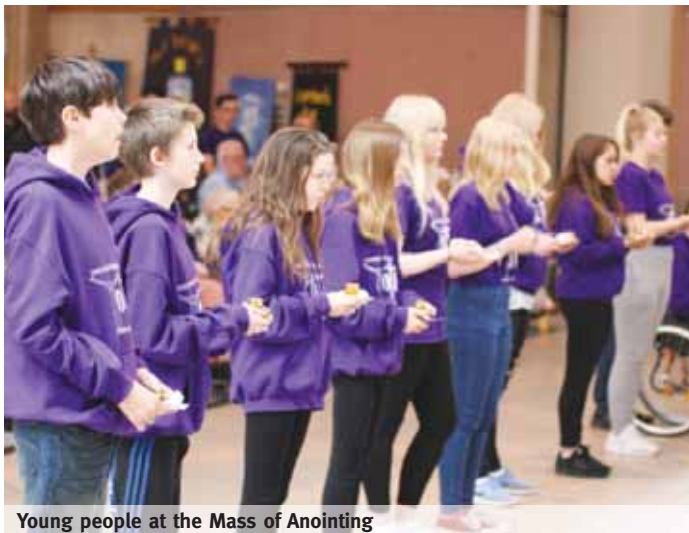
Young people at the Mass of Anointing