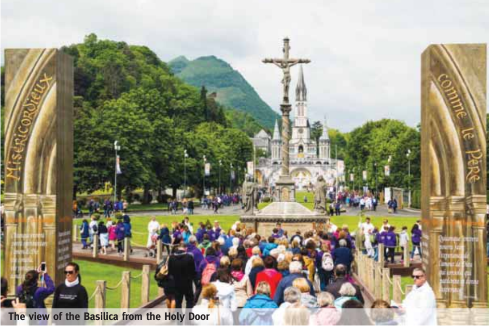
The view of the Basilica from the Holy Door