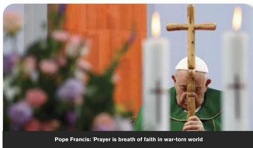
Pope Francis: 'Prayer is breath of faith in war-torn world'

"The Vatican Publishing House (LEV), is publishing, starting today," he announced, "a series