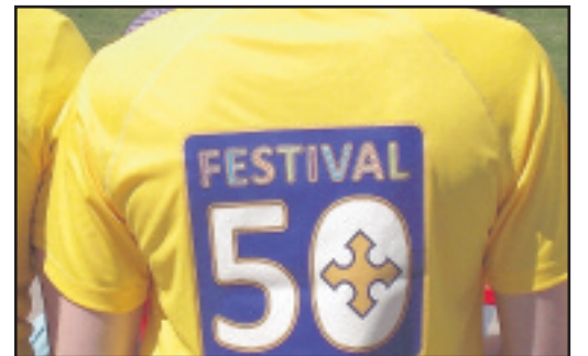
Jubilee/Festival Page 9