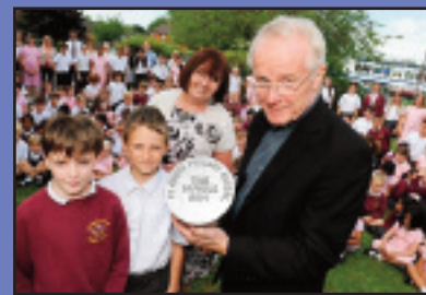
Many schools stories Page 7

To read A&B NEWS on line please visit www.dabnet.org