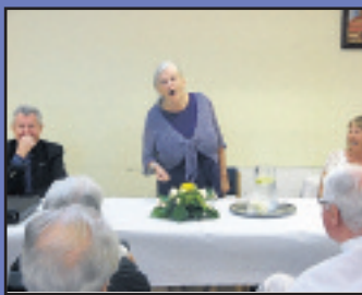
Ann Widdicombe visits Bognor Page 5