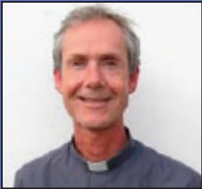
A day in the life of one of our priests Page 3