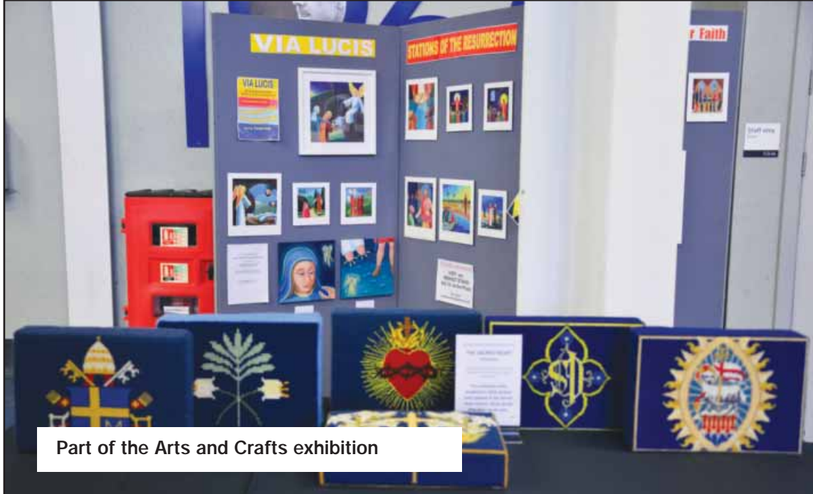
Part of the Arts and Crafts exhibition