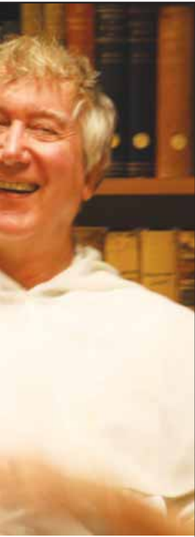
fffe O P

ne diocese as a school boy at f course, appeared in the DVD's 50. He regretted that we no longer e diocese. The Order however has in Crawley as well as in Iraq and I has missions in China and ghout the world.