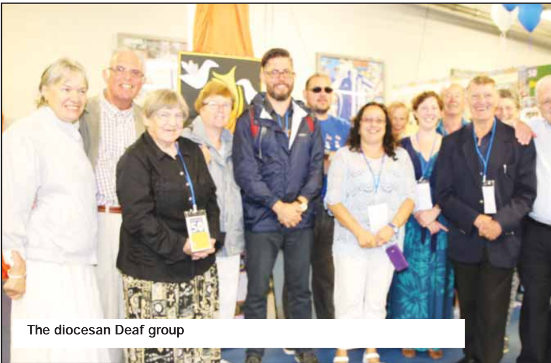
The diocesan Deaf group