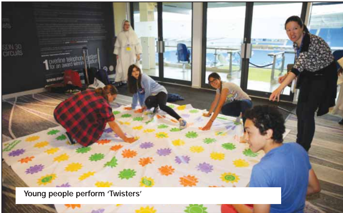
Young people perform 'Twisters'