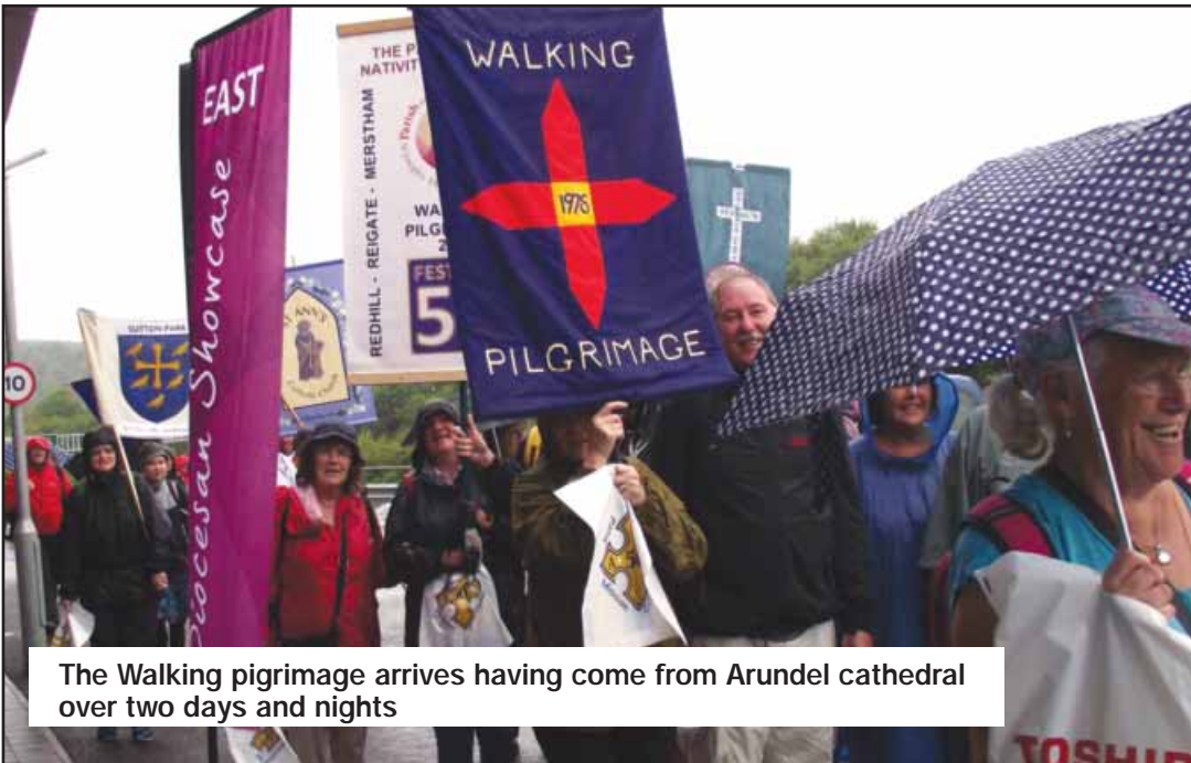
The Walking pilgrimage arrives having come from Arundel cathedral over two days and nights