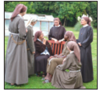
Celebrating the Year for Consecrated Life - Page 4/5

Diocese of Arundel & Brighton No 298 November 2015