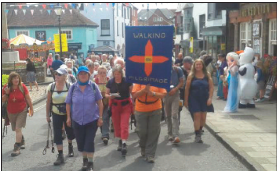
Happy pilgrims arrive in Arundel, singing 'Walk in the Light'

THE PILGRIMS WALKED INTO ARUNDEL on a bright August day, climbing up from Storrington for the final eight miles. Atop the South Downs, the view stretched as far as the eye could see: to the Isle of Wight in the south west with Arundel Castle standing proudly in the middle distance. This was the culmination of a 160 mile, two-week walking pilgrimage from the abbey ruins at Chertsey via Worth Abbey and Brighton, returning to Arundel Cathedral, the mother church of the Diocese and start point of the Jubilee Walking Pilgrimage two months earlier.