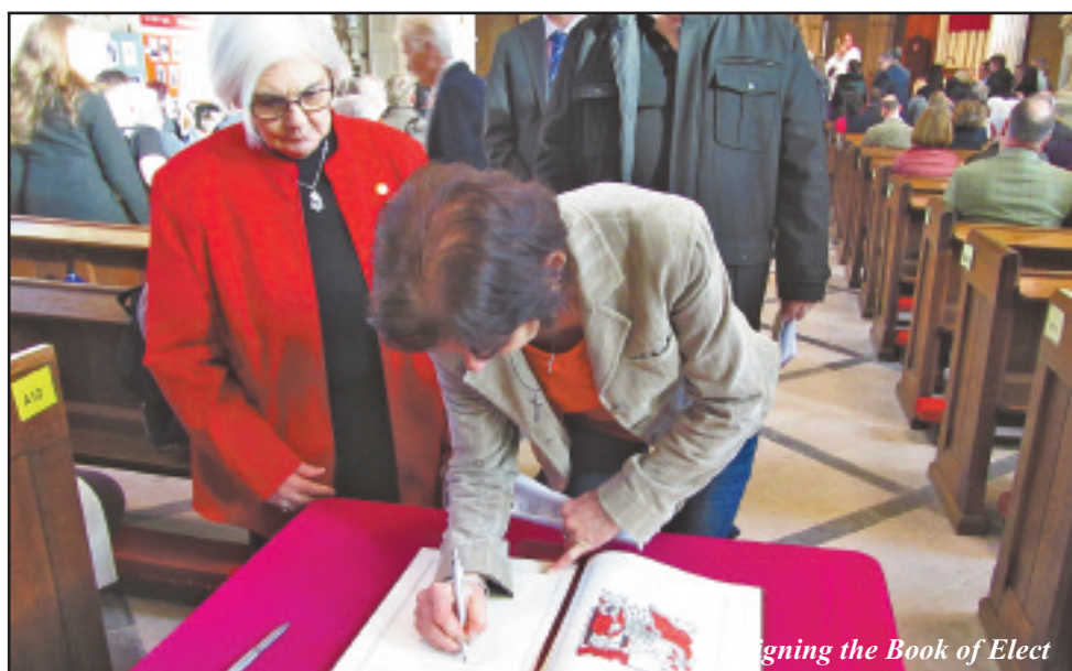
Signing the Book of Elect