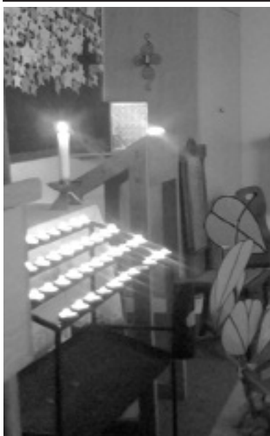
Page 8 ~ Candlelit Vigil for Syria at St Bernard's Catholic High School, Rotherham