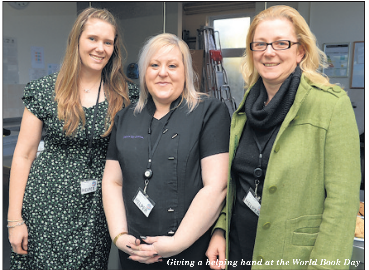
Giving a helping hand at the World Book Day

and Friends Association spokeswoman said, "The PTFA would like to say a huge thank you to all the parents.