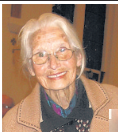
Page 4 ~ Focus on Marriage Page 9 ~ News from St Wilfrid's Centre in Sheffield Page 3 ~ New National Centre in Oldham for Rainbows GB