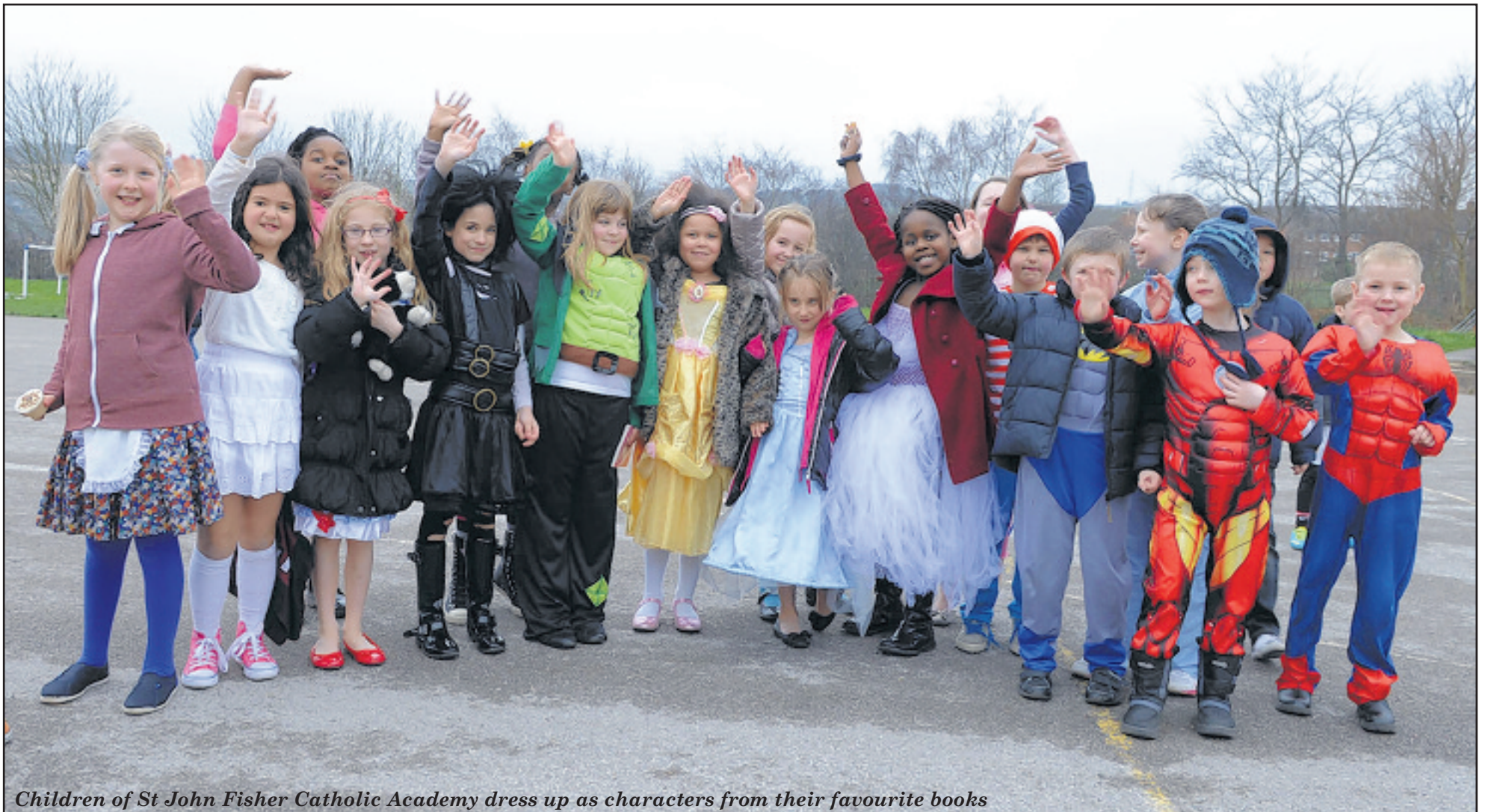
Children of St John Fisher Catholic Academy dress up as characters from their favourite books

wards the library."