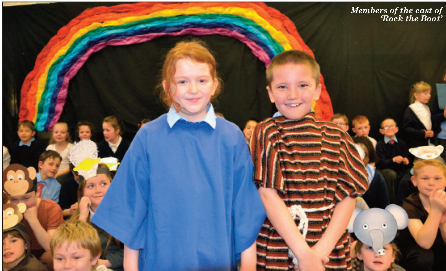
Members of the cast of 'Rock the Boat'

"A huge thank you to all the staff involved for their weeks of hard work and professionalism in getting the children to perform so well. It doesn't just happen by 'magic' and we really appreciate all the very hard work entailed. "Thank you to everyone who donated so generously to Barnsley Hospice and helped us raise £133.52."