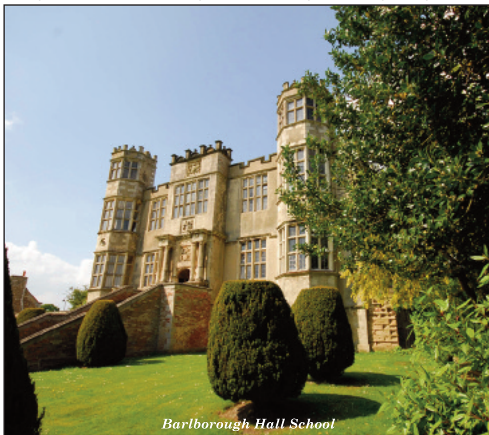
Barlborough Hall School

While Barlborough Hall School maintains its historic character, it also boasts modern facilities including a swimming pool, dance studio, theatre and specialist classrooms.