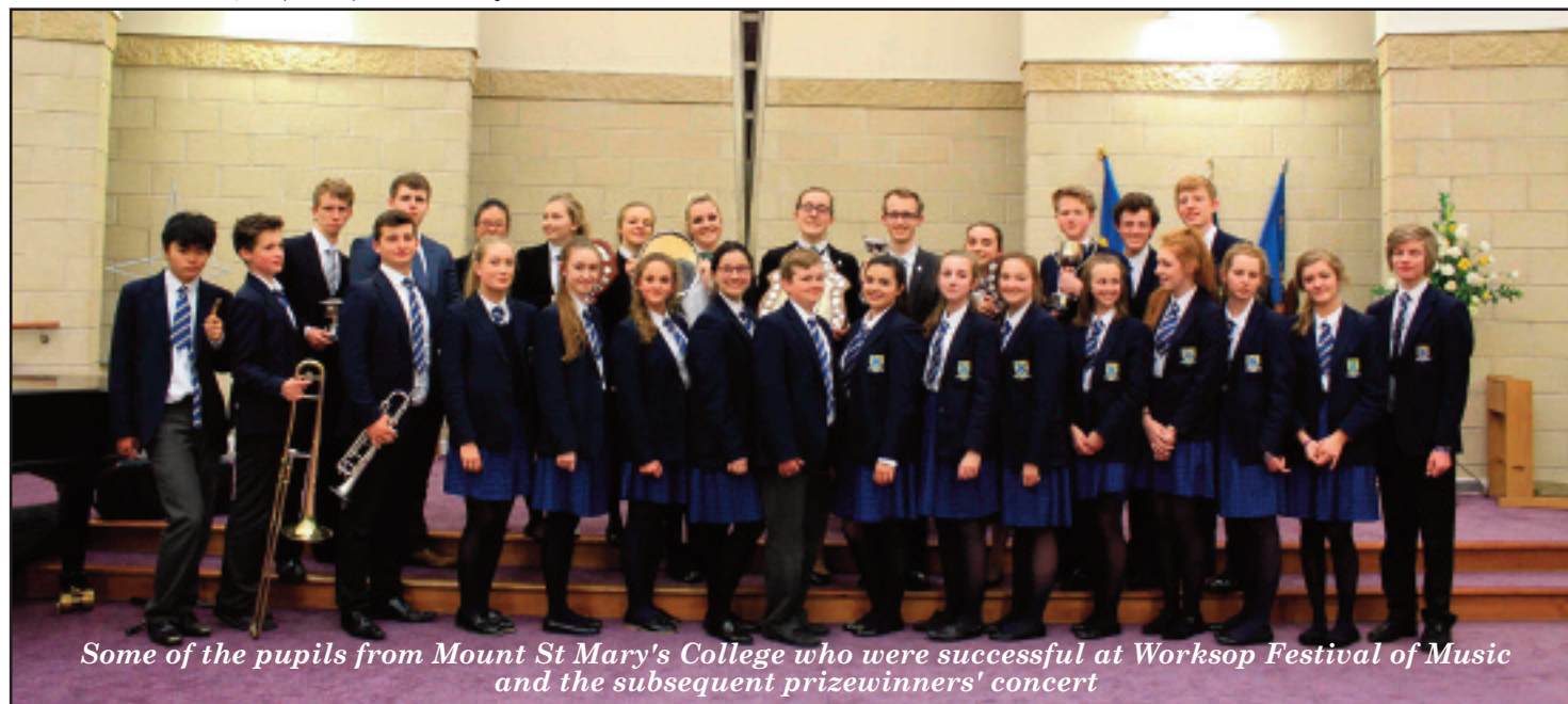
Some of the pupils from Mount St Mary's College who were successful at Workstop Festival of Music and the subsequent prizewinners' concert

their undoubted musical talents, but also the hard work and dedication they have put into practice and rehearsals over many years." Mount St Mary's College, a co-educational day and boarding school in the Jesuit tradition for young people aged 11-18, was founded in 1842. Its preparatory school for children aged 3-11, Barlborough Hall School, opened its doors in 1939. The schools offer a range of music and choral scholarships for talented singers and instrumentalists.