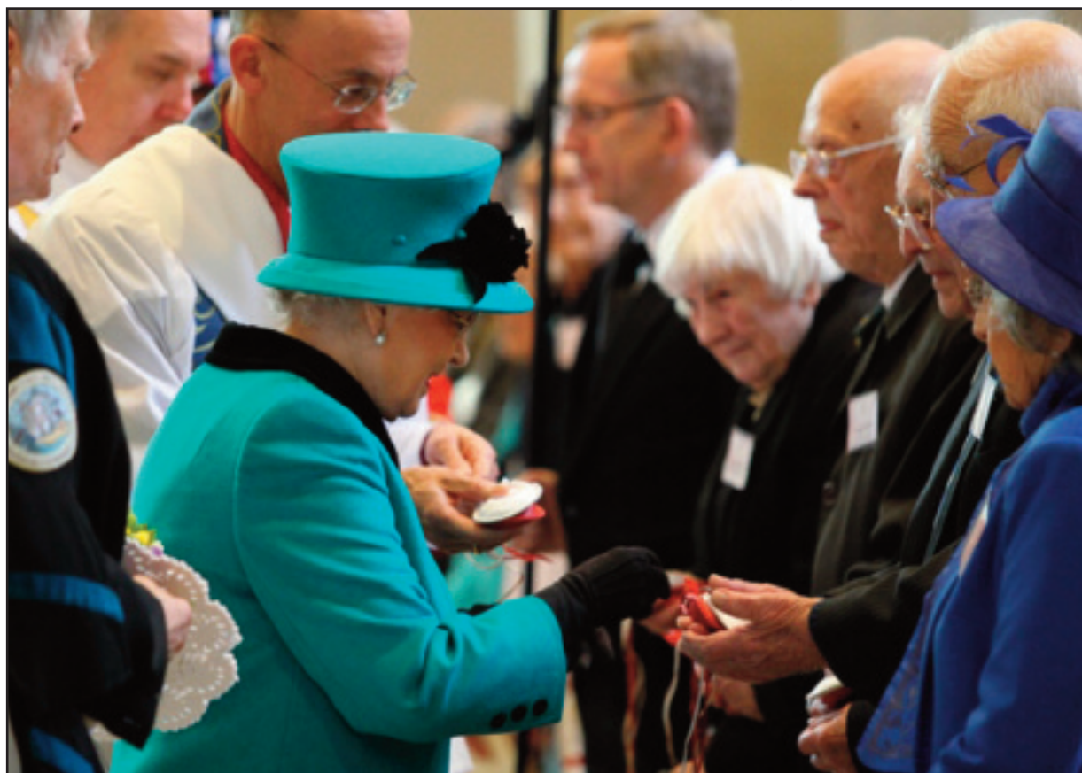
The Queen distributes Maundy Money at Sheffield Cathedral