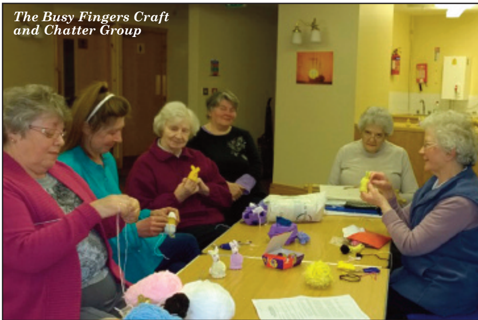
The Busy Fingers Craft and Chatter Group

which proved very popular in the parish. The crème eggs were kindly donated by the local Sainsbury's store at Prospect, Worksop, and their generosity meant that the group was able to donate a staggering £930 to St Mary's Restoration Fund. Well done, ladies!