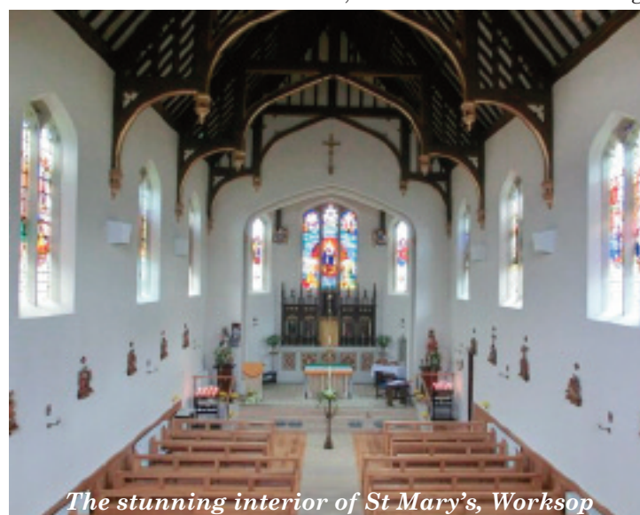
The stunning interior of St Mary's, Worksop

As part of the celebrations, a Summer Carnival is being held in the grounds