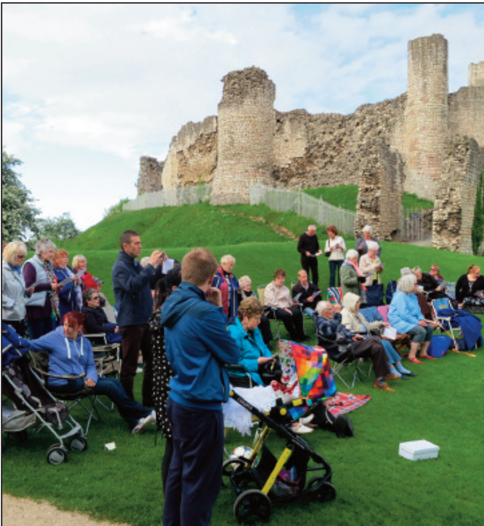
Christians from St Peter’s Church, Conisbrough, Conisbrough Baptist Chapel, All Saints Church, Denaby Main and St Alban’s Church, Denaby Main, who make up Conisbrough and Denaby Main Churches Together, celebrate Pentecost with a Songs of Praise in the grounds of Conisbrough Castle.