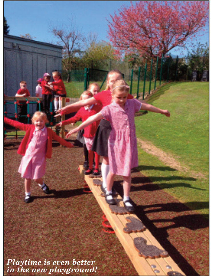
Playtime is even better in the new playground!