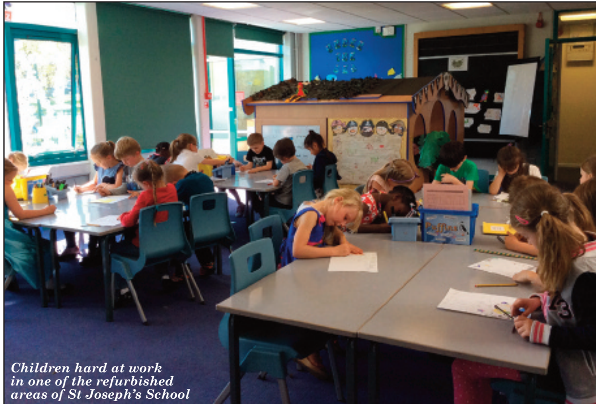
Children hard at work in one of the refurbished areas of St Joseph's School

pleased with the comments in the Ofsted report which highlighted the 'pupils positive attitude to learning and each other'. "Saint Joseph's continues to grow from strength to strength. The school was found to be 'a school which goes the extra mile to help pupils and families, overcome issues that might affect learning. The pupils achieve well and standards are rising because staff and pupils have risen to high expectations."