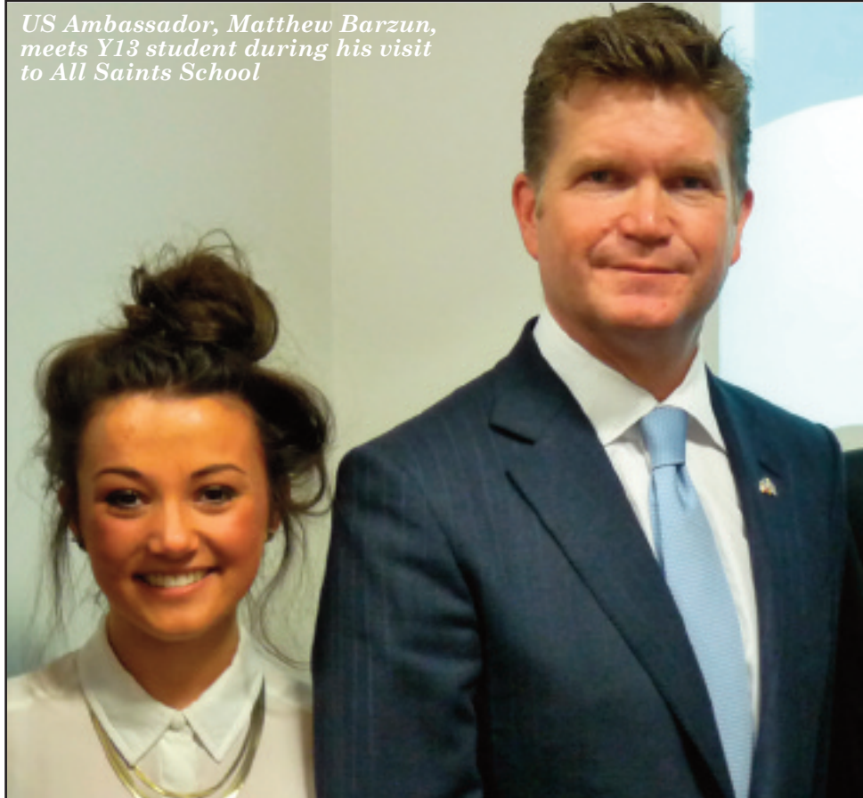
US Ambassador, Matthew Barzun, meets Y13 student during his visit to All Saints School