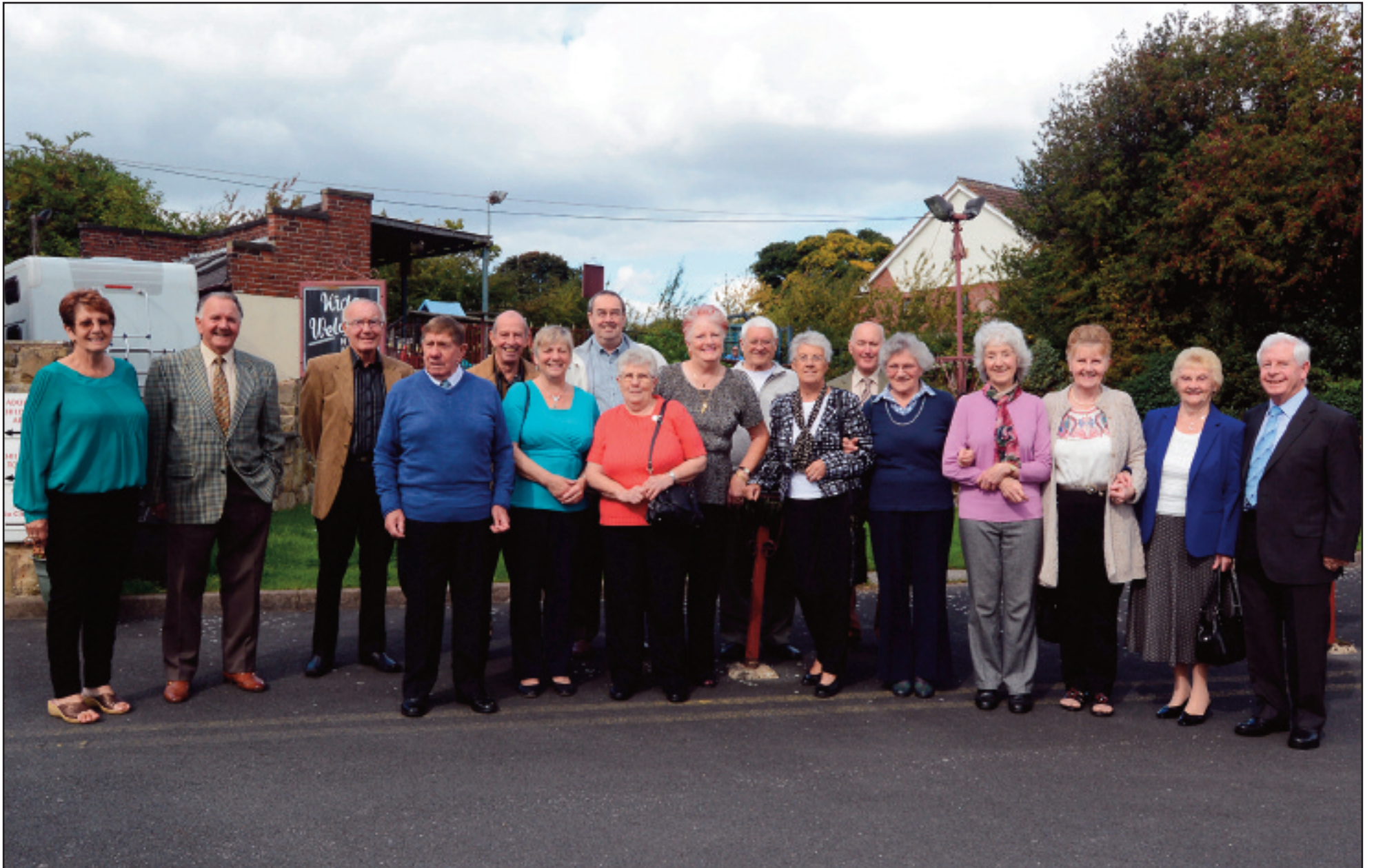
Former pupils of St Theresa's Roman Catholic Primary School, Prince of Wales Road, Sheffield who left the school between 1951 and 1954 held their 13th annual reunion at the Noahs Ark, Intake, Sheffield.