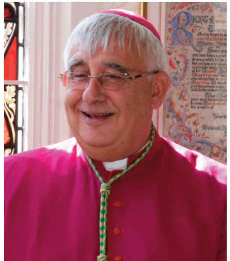
St. Peter in Chains Doncaster