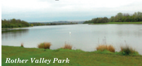
Rother Valley Park