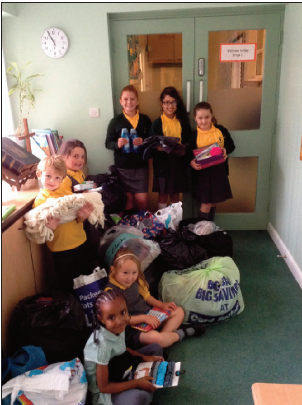
Pupils from St Joseph's School, Handsworth have been busy collecting clothing, shoes, blankets and toiletries to send to help the refugees in Calais. Our photograph above shows the children with the goods.