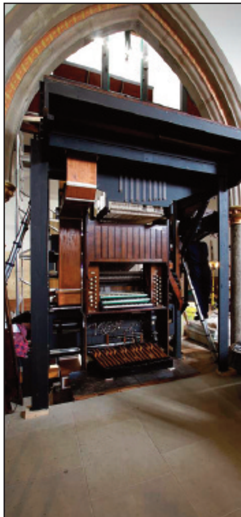
The newly refurbished T C Lewis organ in St Marie's Cathedral

Images of the stages in the St Marie's organ rebuild can be found on the Cathedral web site - http://stmariecathedral.org/ - and at https://drive.google.com/open?id=oBx_TMhNKdfHacFNodHhYUoYoeXc .