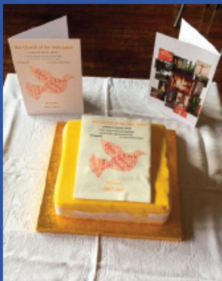
Holy Spirit Parish, Dronfield celebrate 50 years