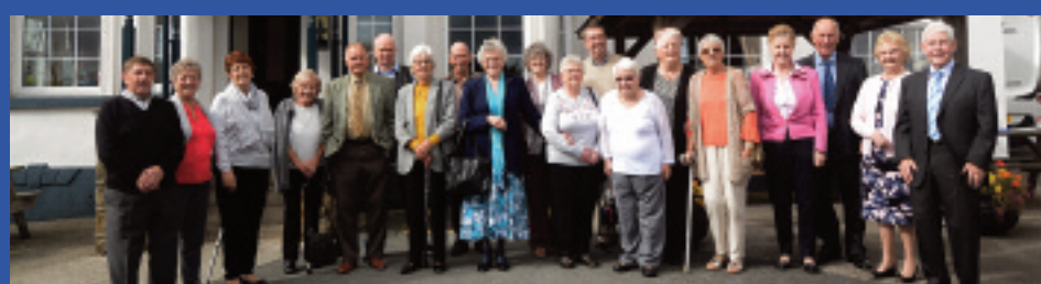
St Theresa’s Annual Reunion

Looking for a gap year where you can make a difference?