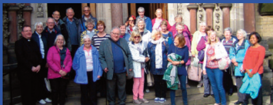
Hope Valley Churches visit the Bar Convent