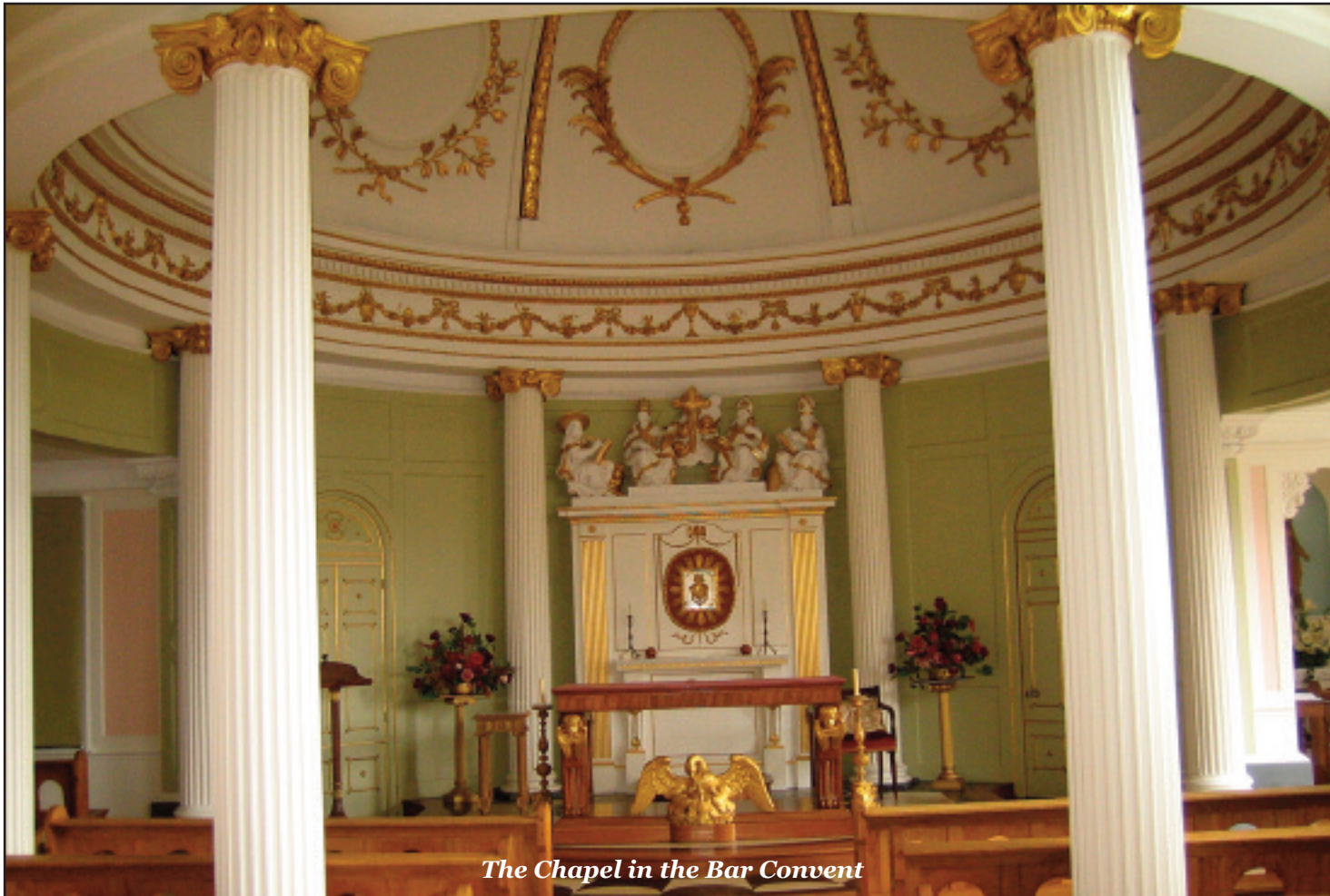
The Chapel in the Bar Convent

Well then, think The Bar Convent which has everything - a fascinating history, a stunning new exhibition, an award-winning café and first class accommodation if a day isn't enough.