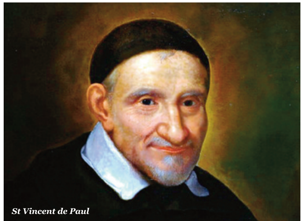
St Vincent de Paul

On Wednesday, 27 September, the feast of our patron, St Vincent de Paul, a Mass was celebrated at St Vincent’s Furniture Store to mark our 30th Anniversary.