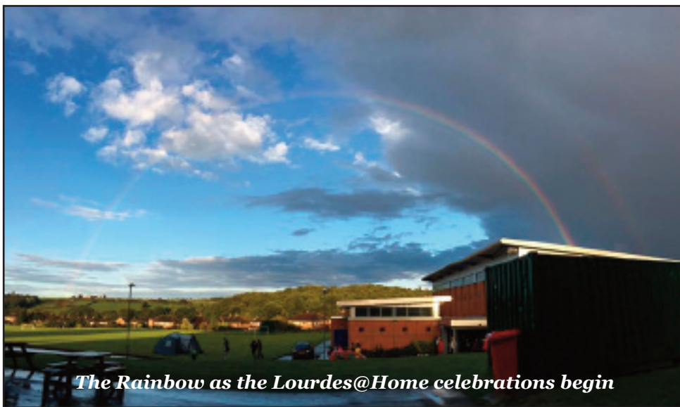
The Rainbow as the Lourdes@Home celebrations begin