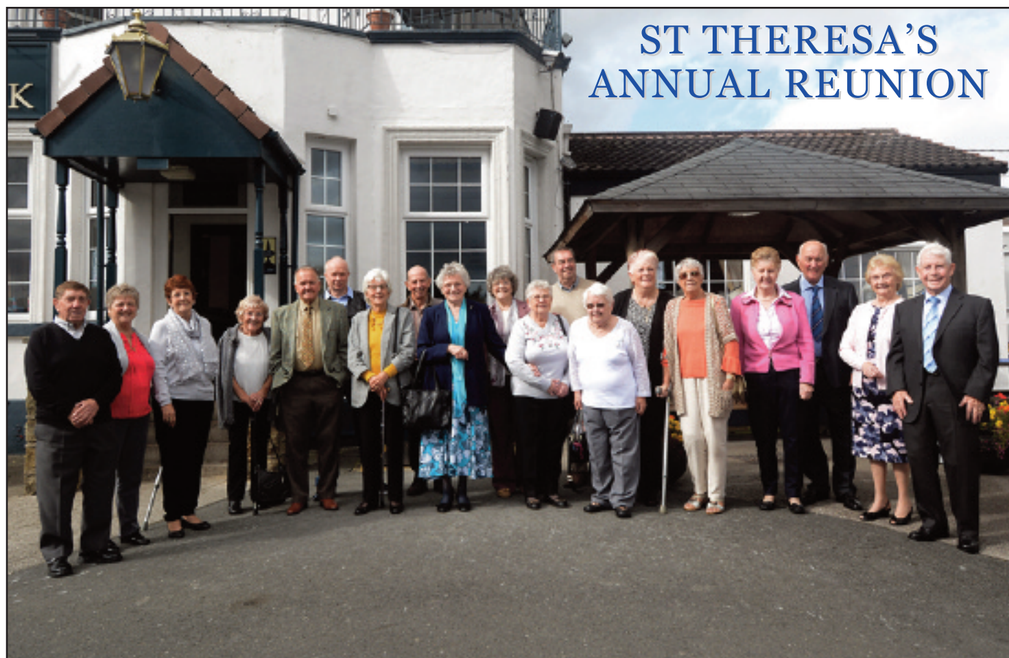
Former pupils who left St Theresa's Roman Catholic School, Prince of Wales Road, Manor Estate, Sheffield between 1951 and 1953 held their 15th Annual Reunion at The Noah's Ark, Intake, Sheffield on Saturday, 30 September.