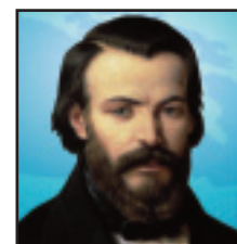
Blessed Frederic Ozanam